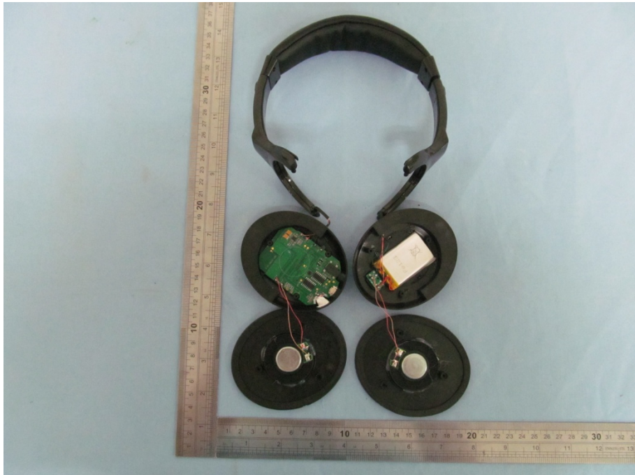
FRONT VIEW OF PCB