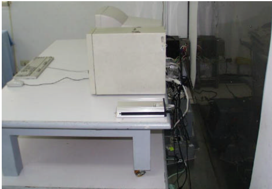
Conducted Emission Setup Photos (Worst Emission Position)