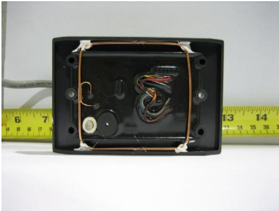
RF MAIN BOARD – TOP SIDE with EPOXY

EUT INTERNAL PHOTO: FCC ID: OGSSC2300; IC: 6449A-SC2300