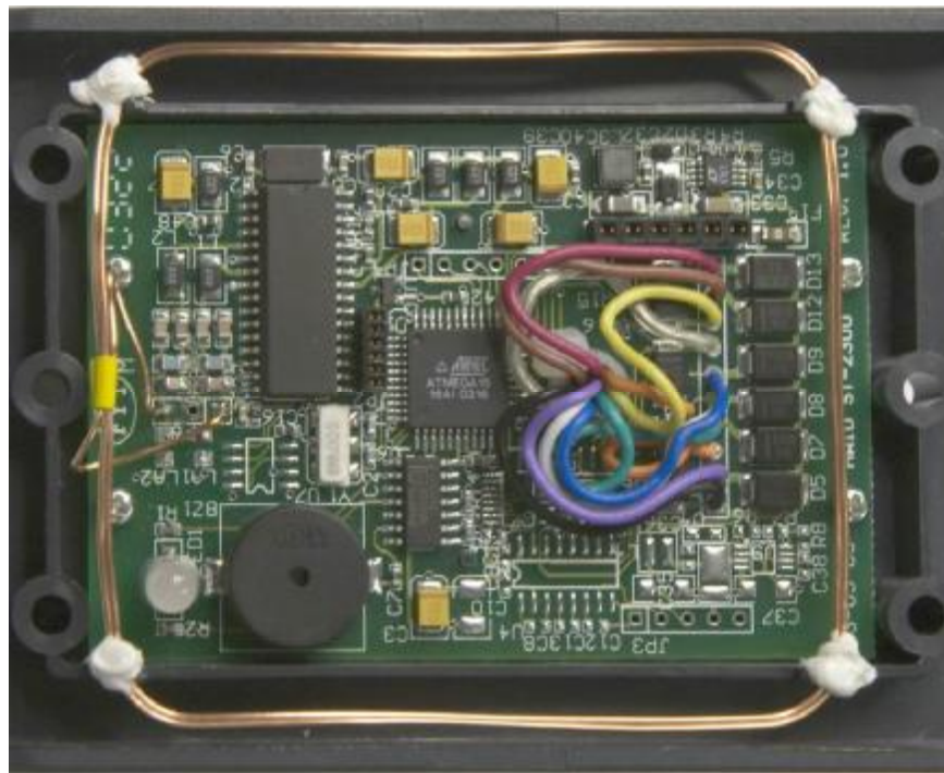
RF MAIN BOARD – TOP SIDE without EPOXY