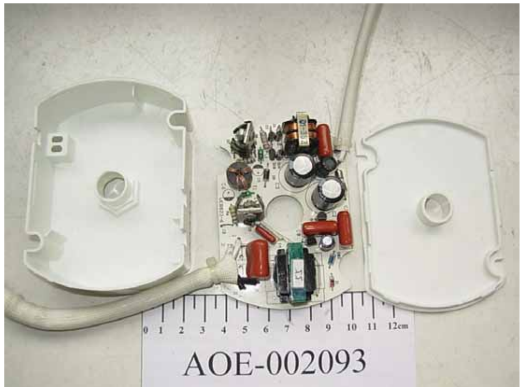
FIGURE 1 BALLAST (M/N: VEB82155) COVER REMOVED