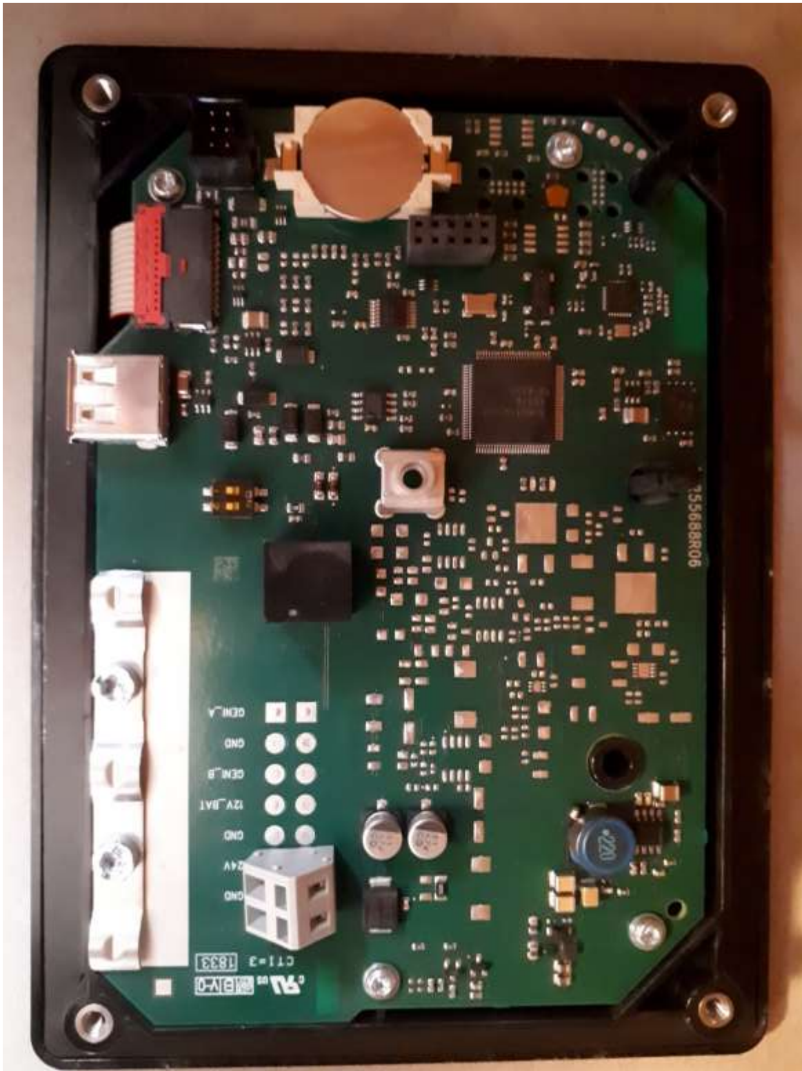
Figure 2 Top View of main PCB