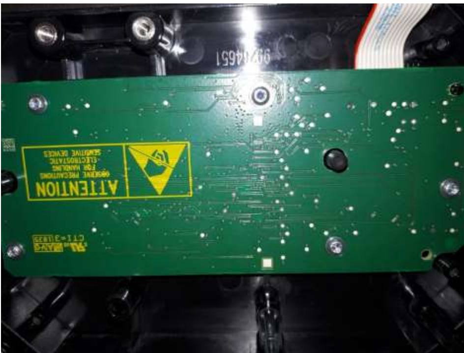
Figure 5 Bottom view of HMI PCB