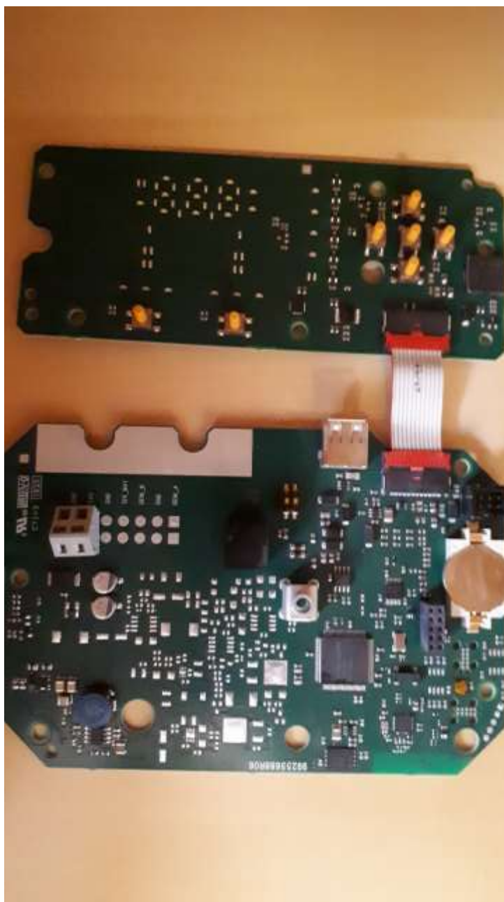
Figure 1 Top view of the two PCB's in the CU 241. HMI PCB on top, main PCB below.