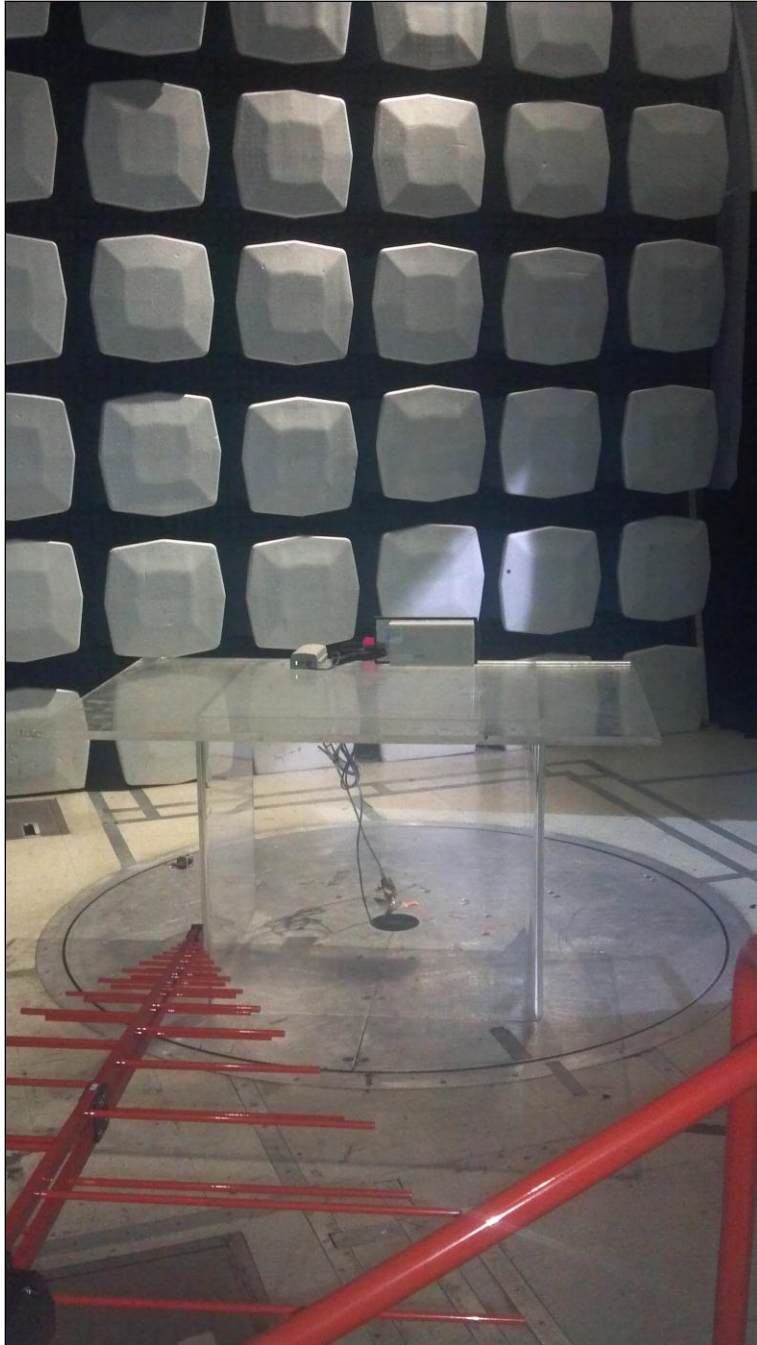
Photograph 1. Radiated Spurious Emissions, Test Setup, 30 MHz – 1 GHz