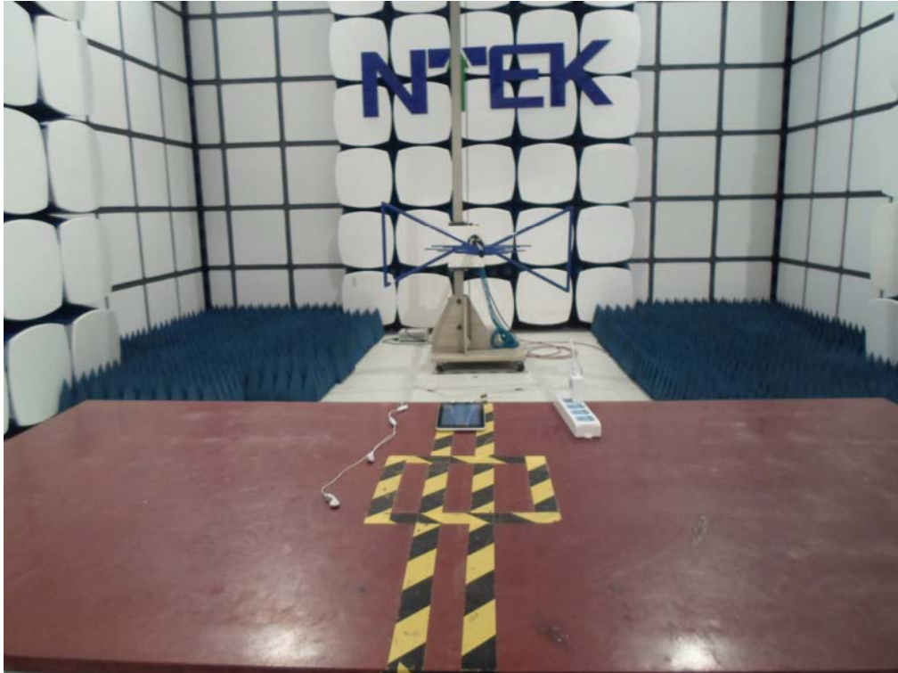
Radiated Measurement Photos (1000-6000MHz)