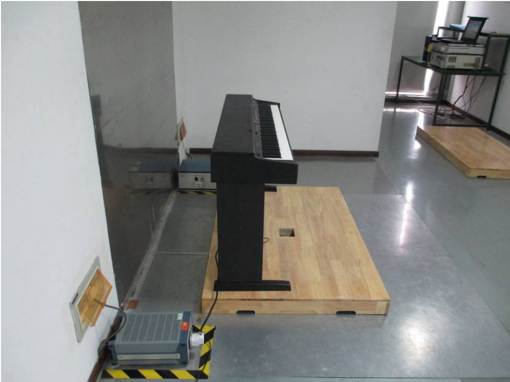
Conducted Emissions Setup Side View