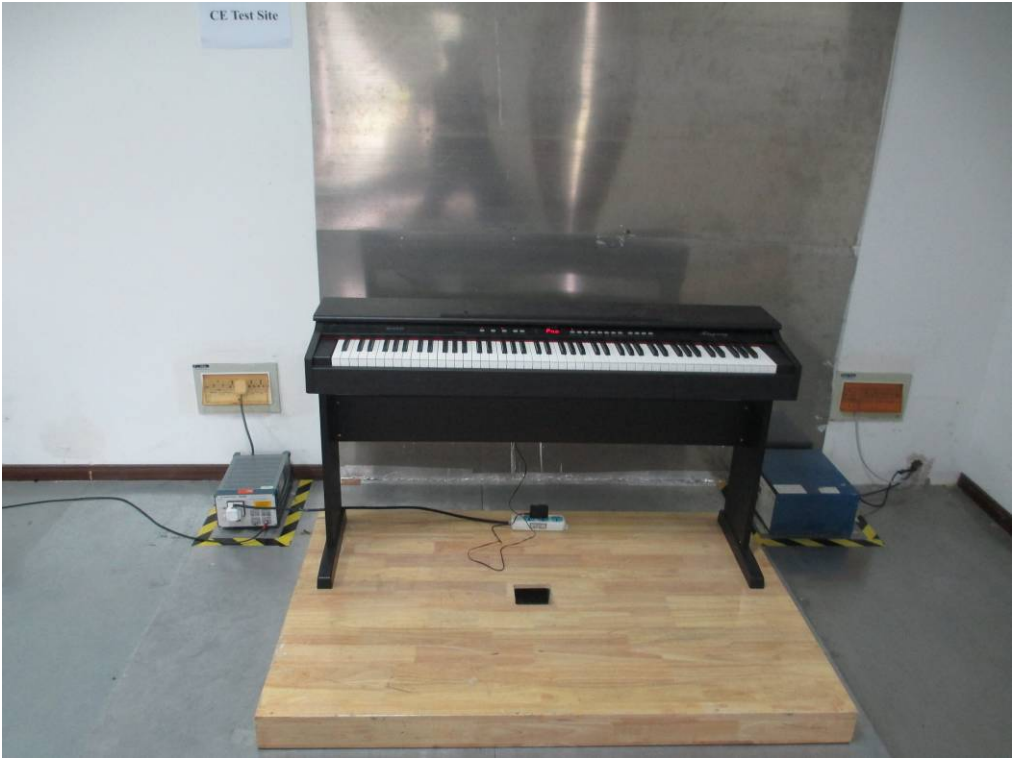
Conducted Emissions Setup Front View