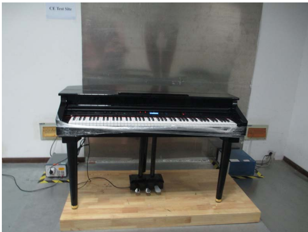
Conducted Emissions Setup Front View