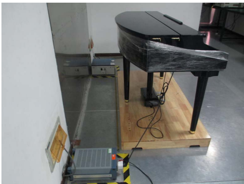
Conducted Emissions Setup Side View