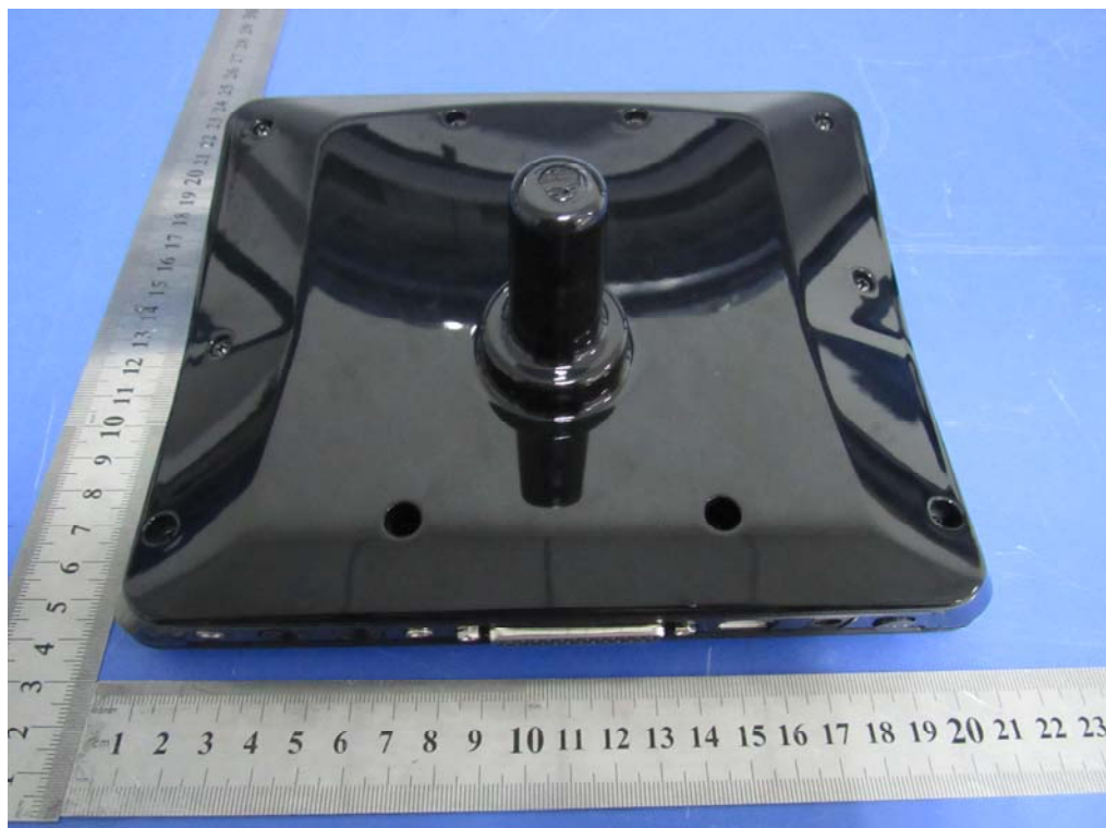
EUT Cover Off - Rear View