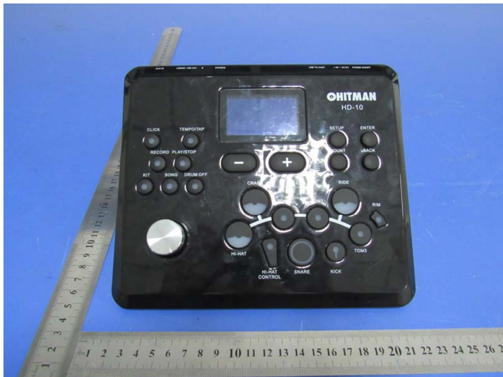
EUT Cover Off - Front View