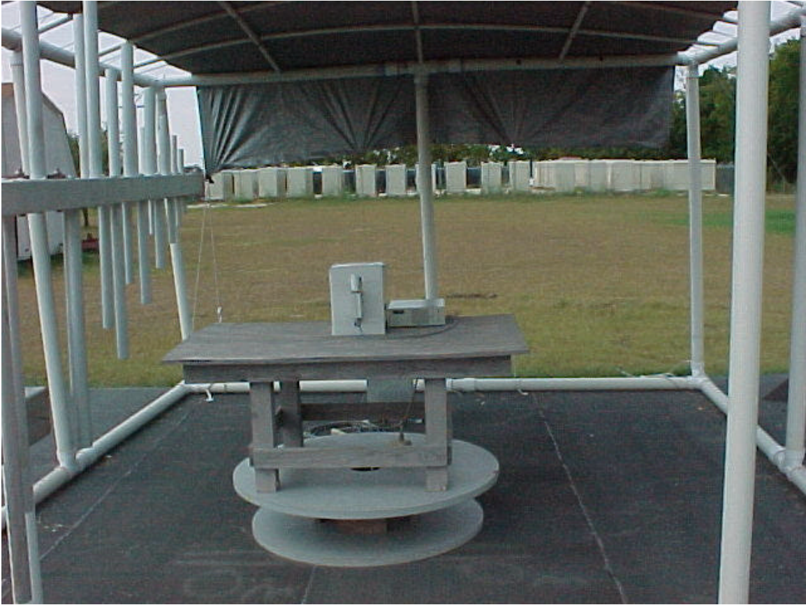
RADIATED EMISSIONS - FRONT OF UNIT