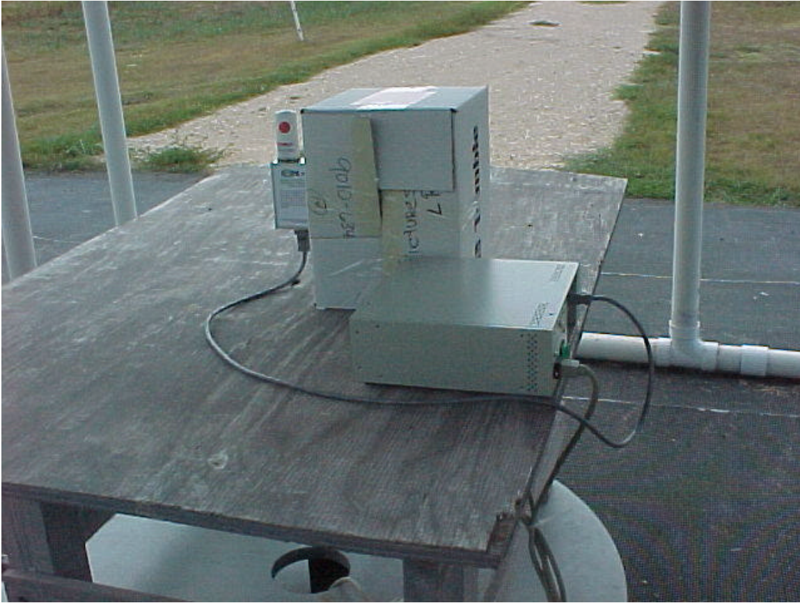
RADIATED EMISSIONS - RIGHT-REAR OF UNIT