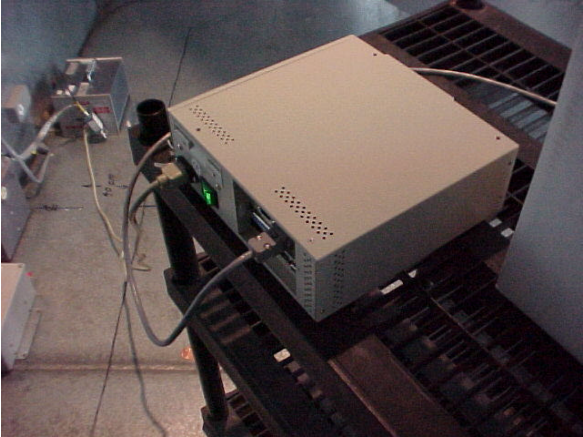
CONDUCTED EMISSIONS - BACK OF UNIT