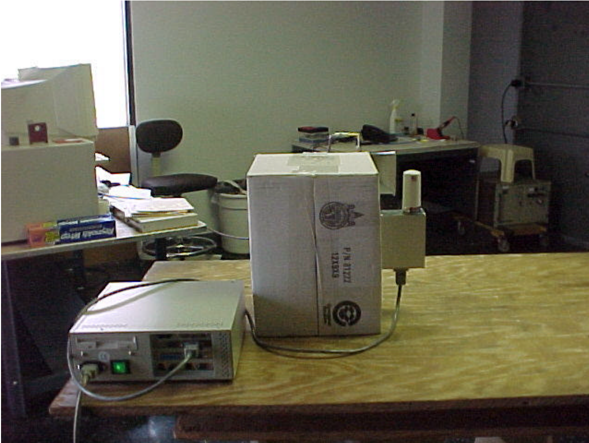
RADIATED EMISSIONS, HIGH FREQ. – REAR OF UNIT