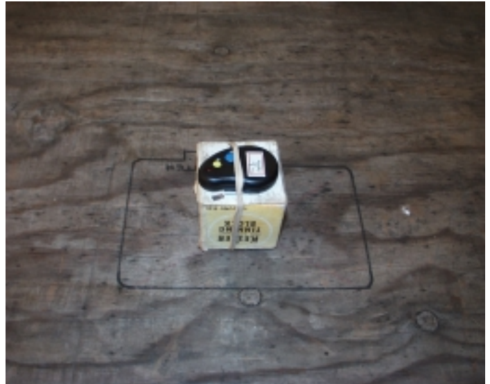
Radiated Open Site Test Set-up