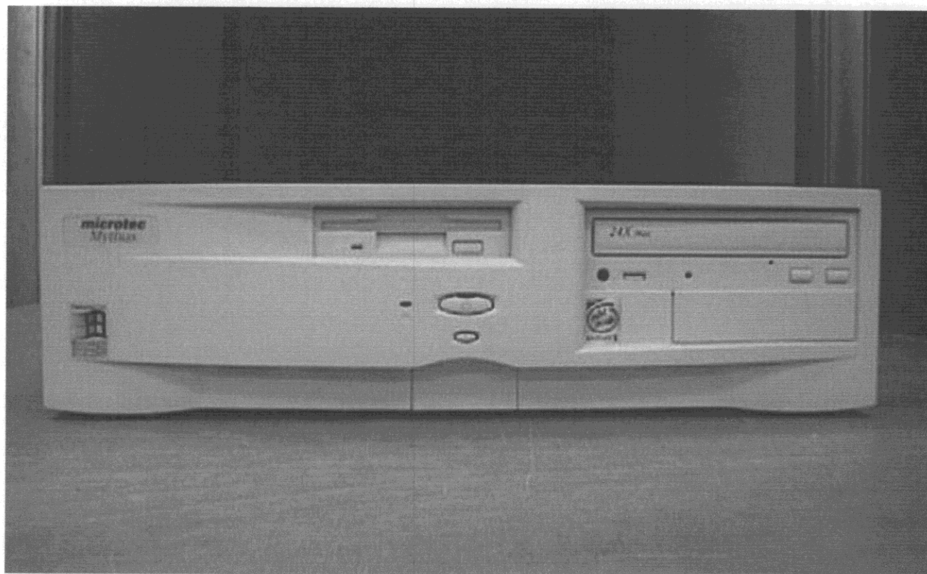
Photo 1 - Microtec Desktop Personal Computer Mythus 6300 front view