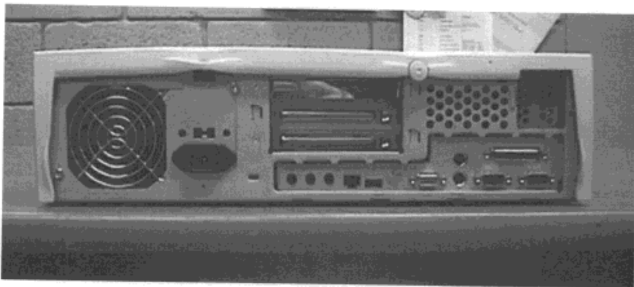
Photo 2 - Microtec Personal Computer Mythus 5233 rear view

Microtec Personal Computer Mythus 5233 Electromagnetic Compatibility FCC Test Report