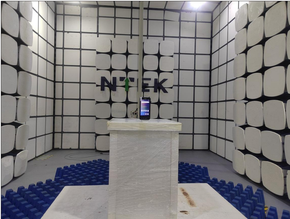
AC Conducted Measurement Photos