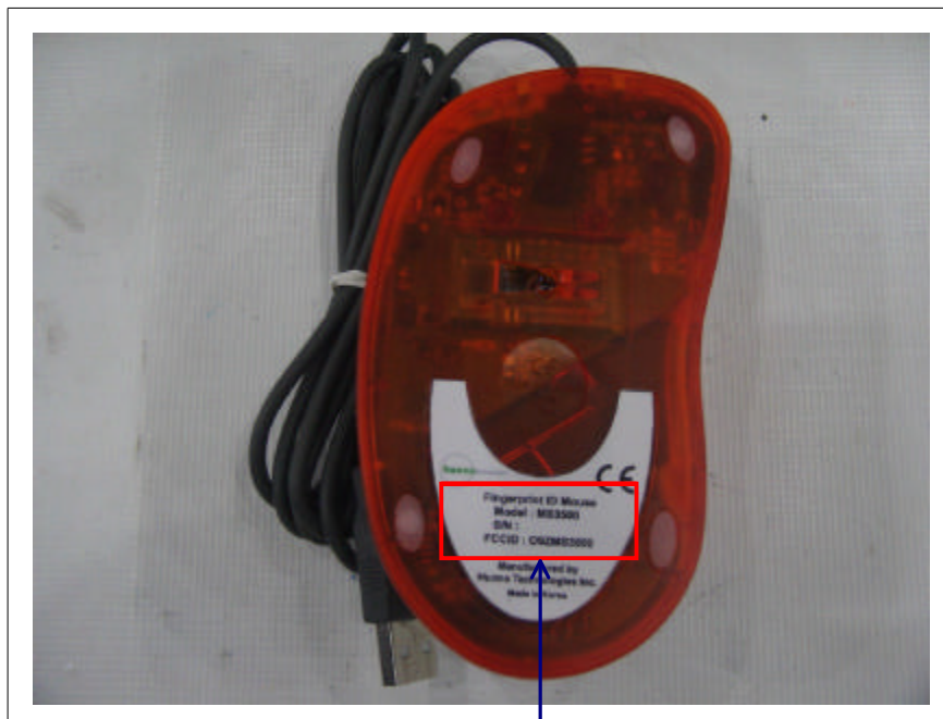
FCC Identifier Location FCC ID : O9ZMS3500