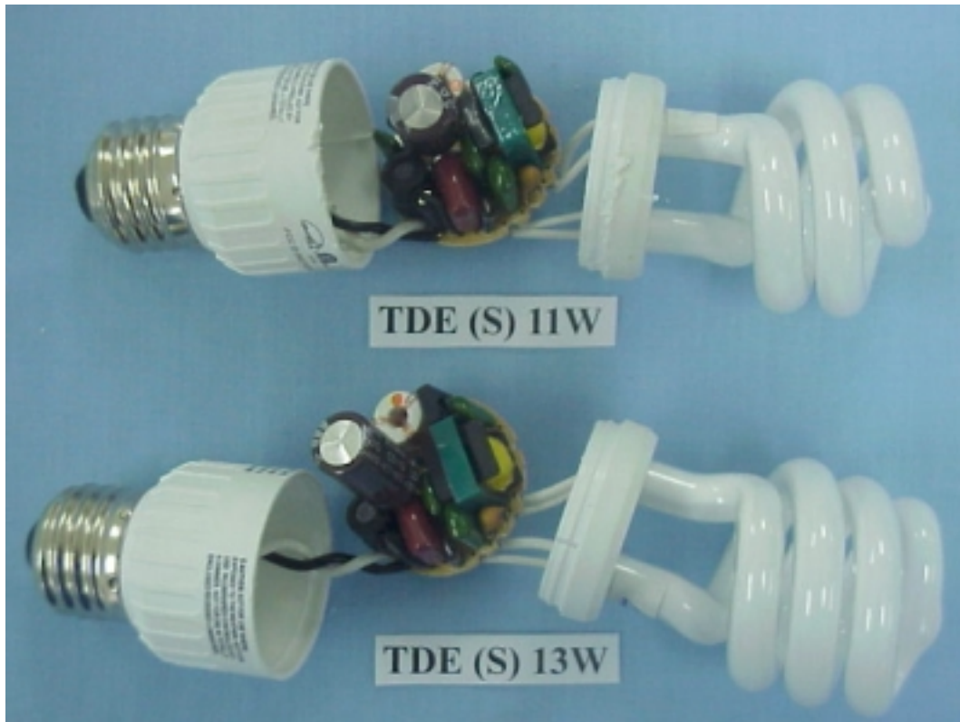
FIGURE 1 ENERGY SAVING LAMP (M/N: TDE (S) 11W / 13W) COVER REMOVED