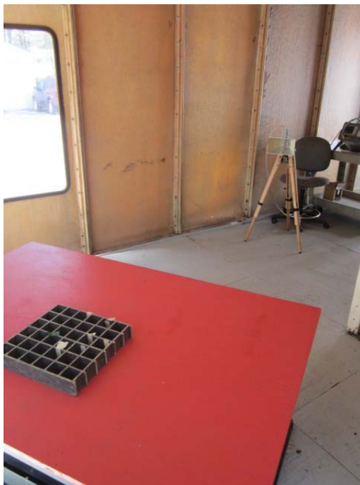
1 to 18 GHz, Vertical Antenna Polarization