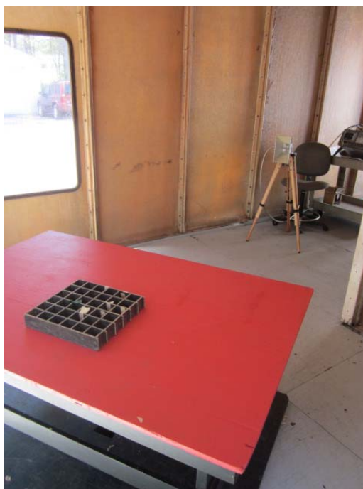
1 to 18 GHz, Horizontal Antenna Polarization