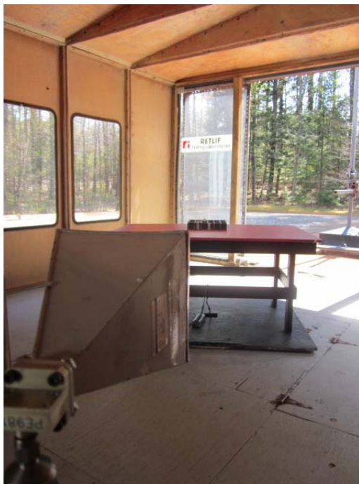
18 to 26 GHz, Vertical Antenna Polarization