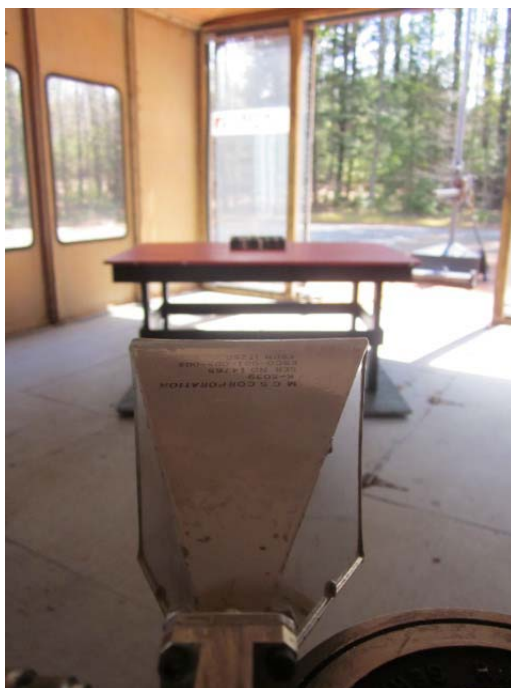
18 to 26 GHz, Horizontal Antenna Polarization