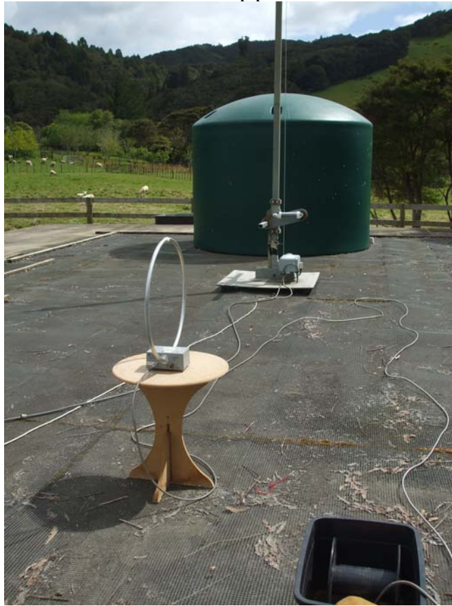
Radiated emissions test set up photos – Above 30 MHz