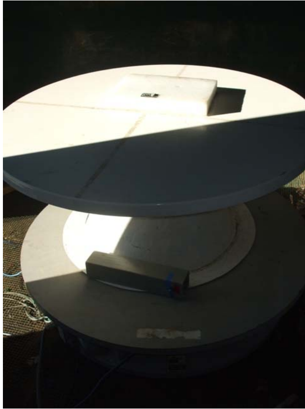
Test sample laying flat on the test table