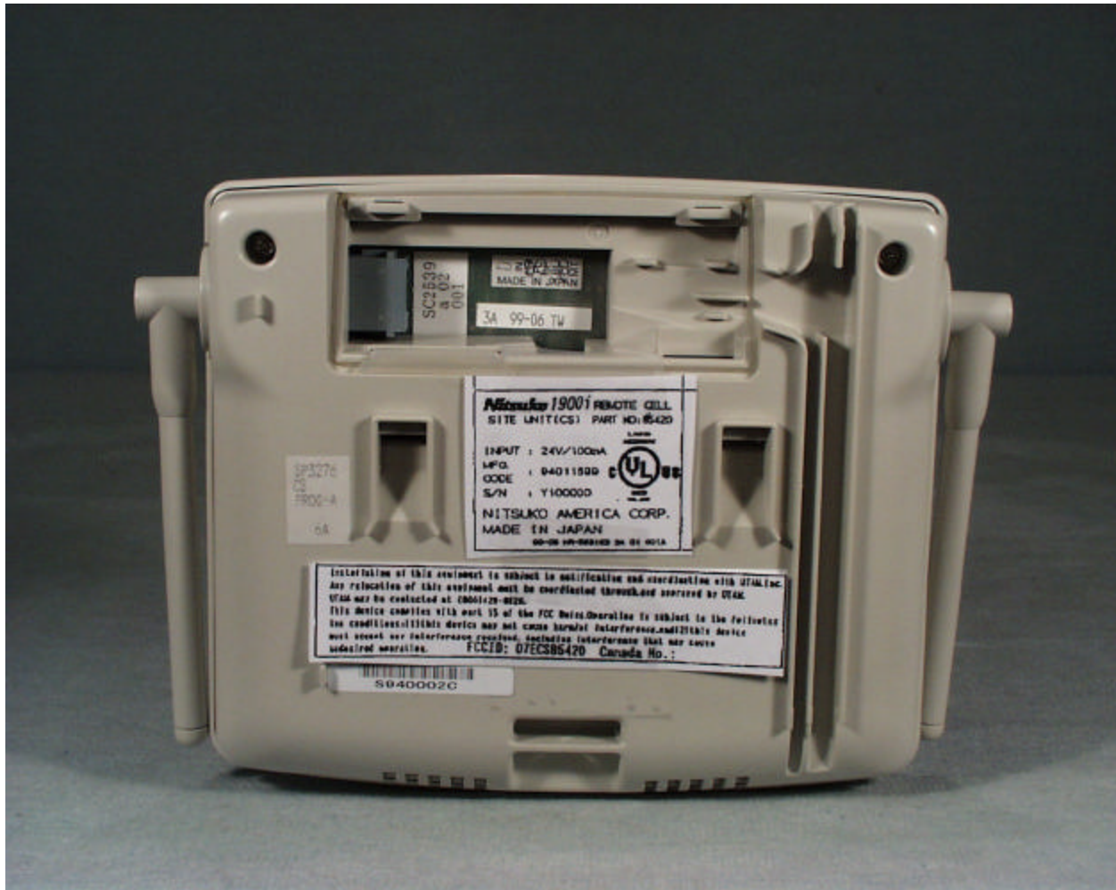
Photograph showing label placement