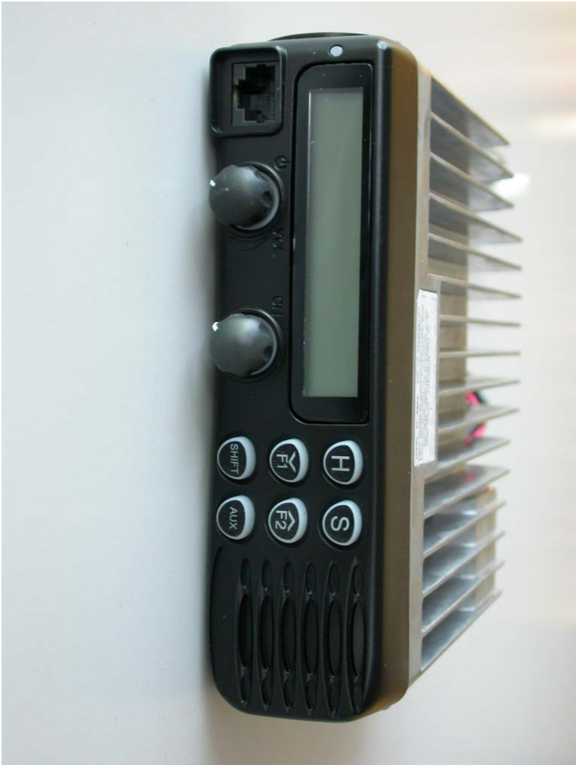
1) Model view of SC-980 – Front view