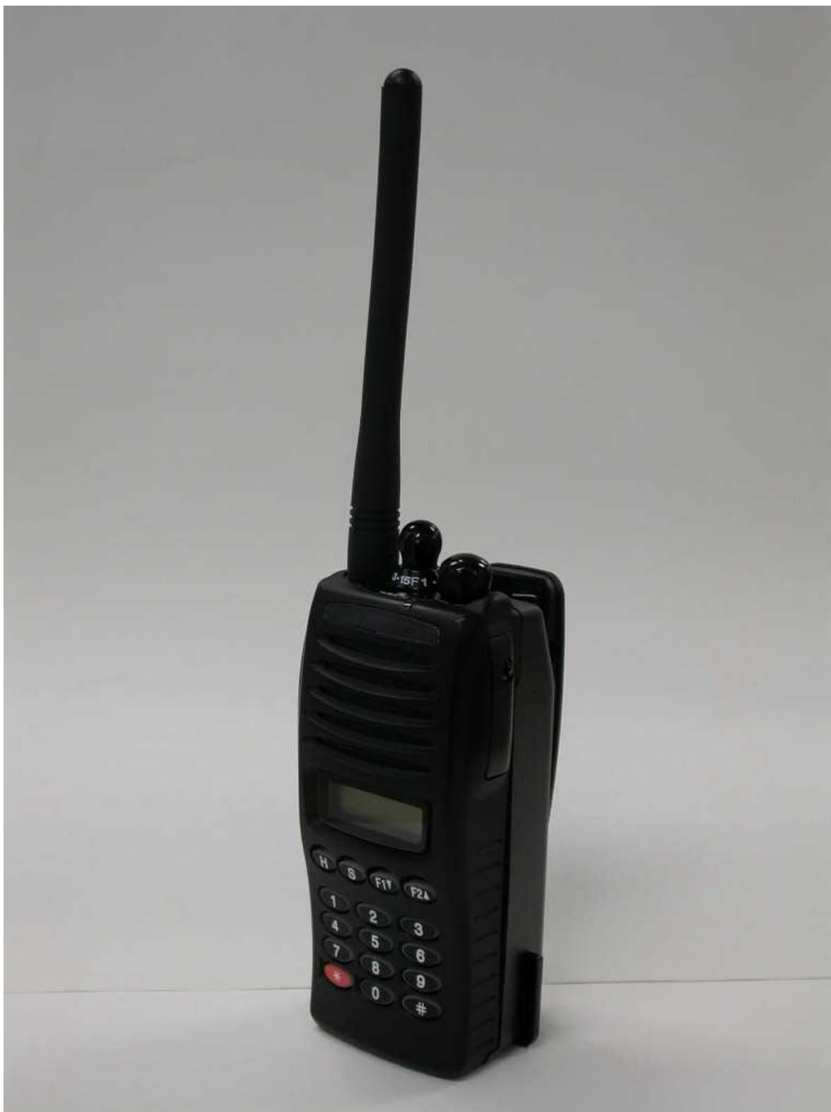
1) Model view of SC-280 A – Front Three- Quarter View 1