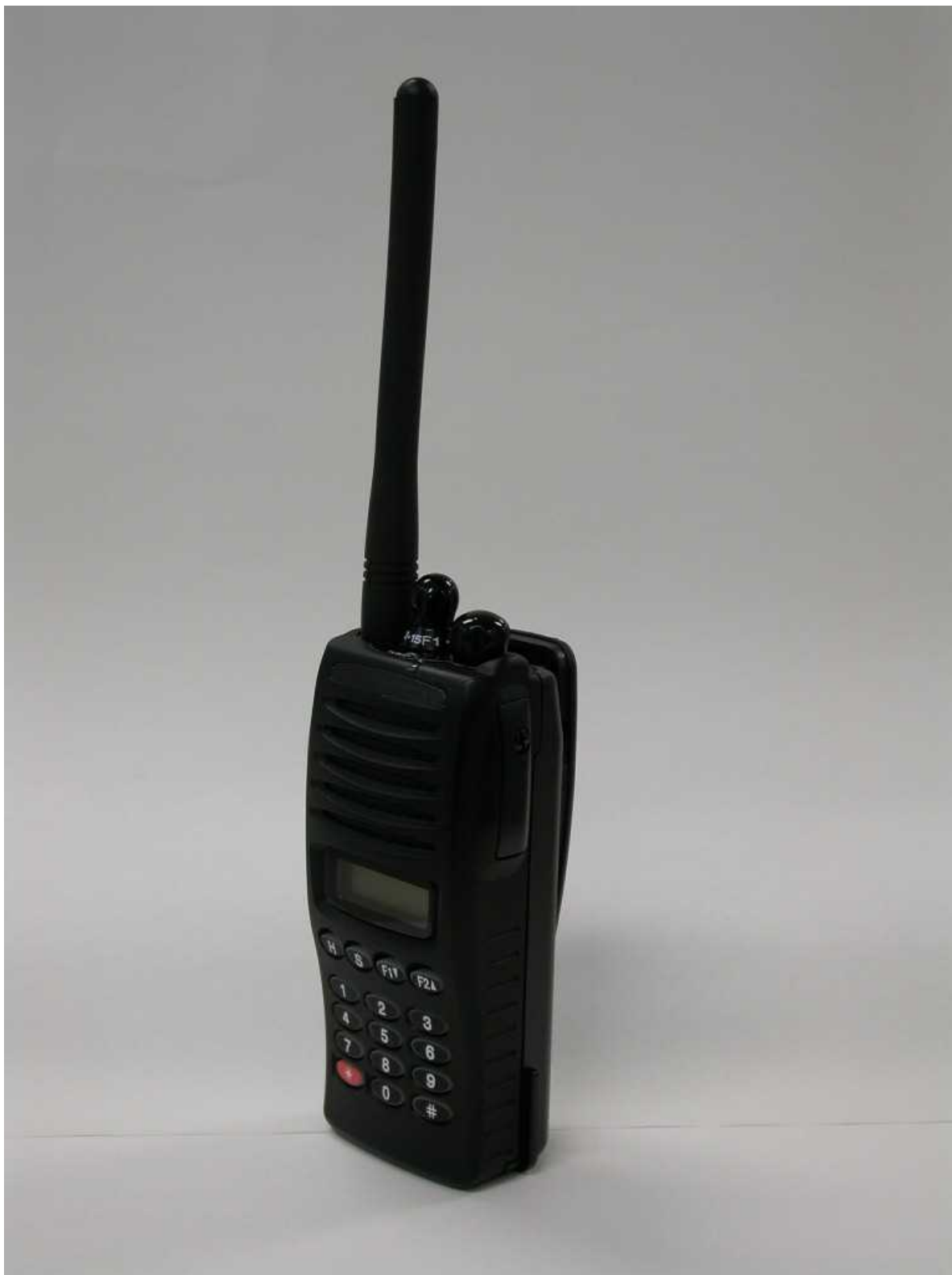
1) Model view of SC-280 A – Front Three- Quarter View 1