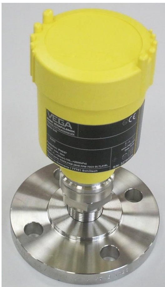
Top View (with optional flange)