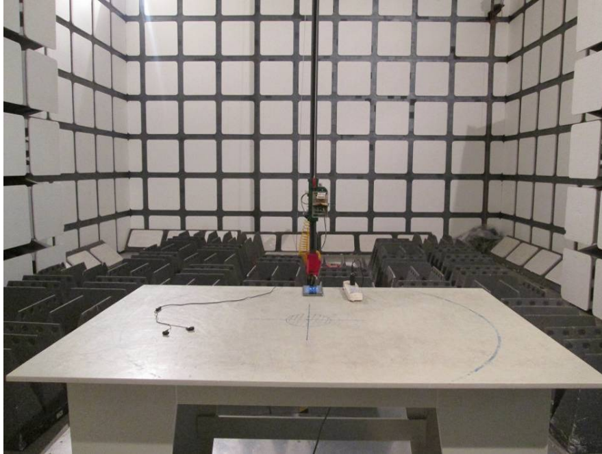
Radiated Emissions –Rear View (1-25 GHz)