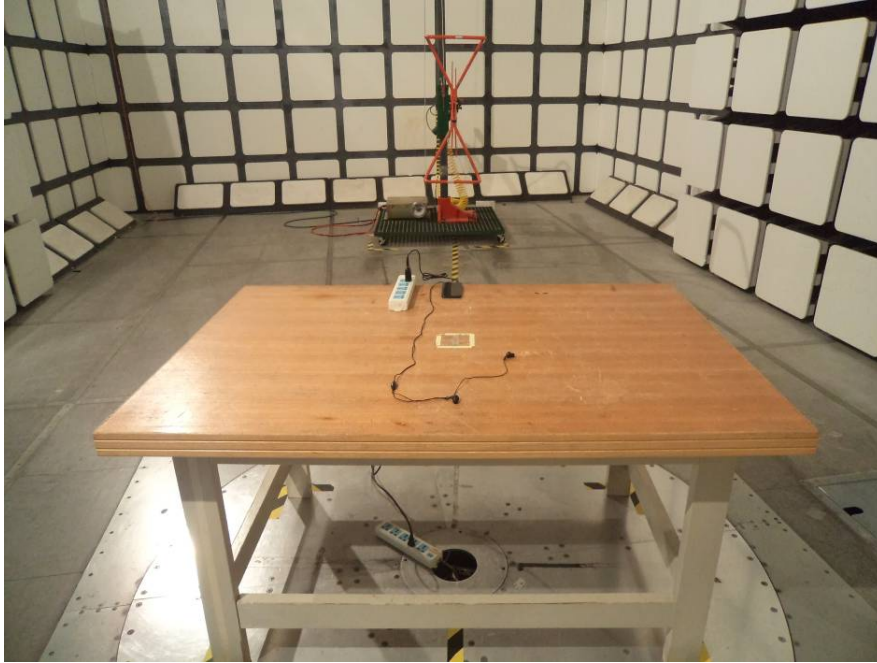
Radiated Emissions – Rear View (30-1000 MHz)