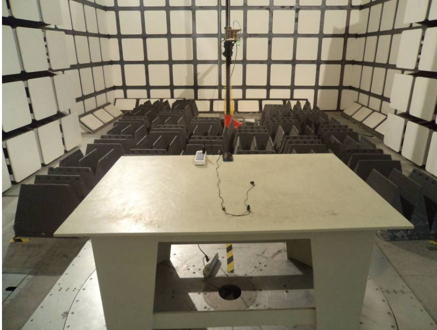
Radiated Emissions – Rear View (1-25 GHz)