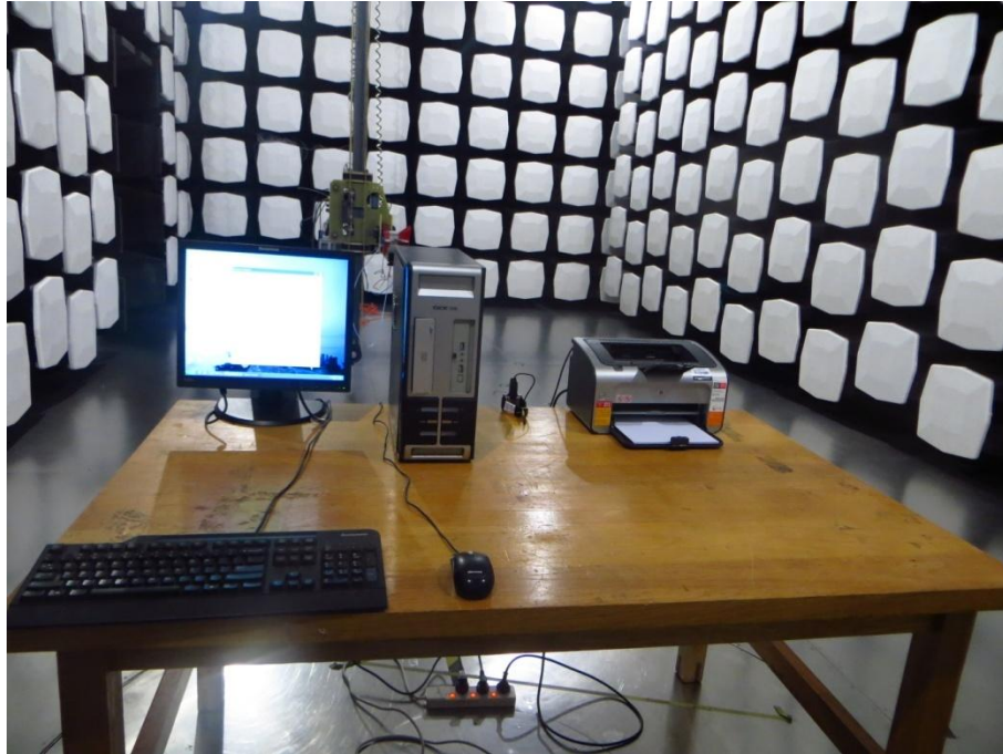
Above 1 GHz rear view