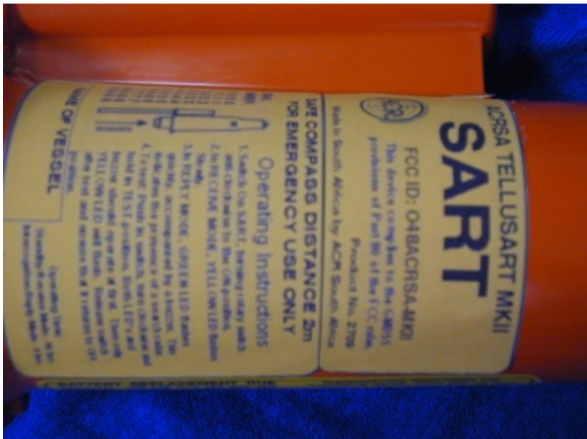
FIGURE 3 SART OPERATING INSTRUCTION LABEL