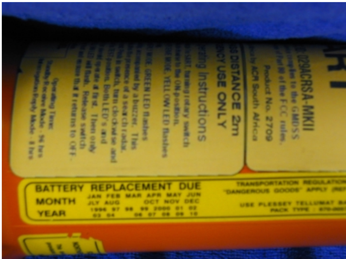
FIGURE 4 SART BATTERY EXPIRATION LABEL