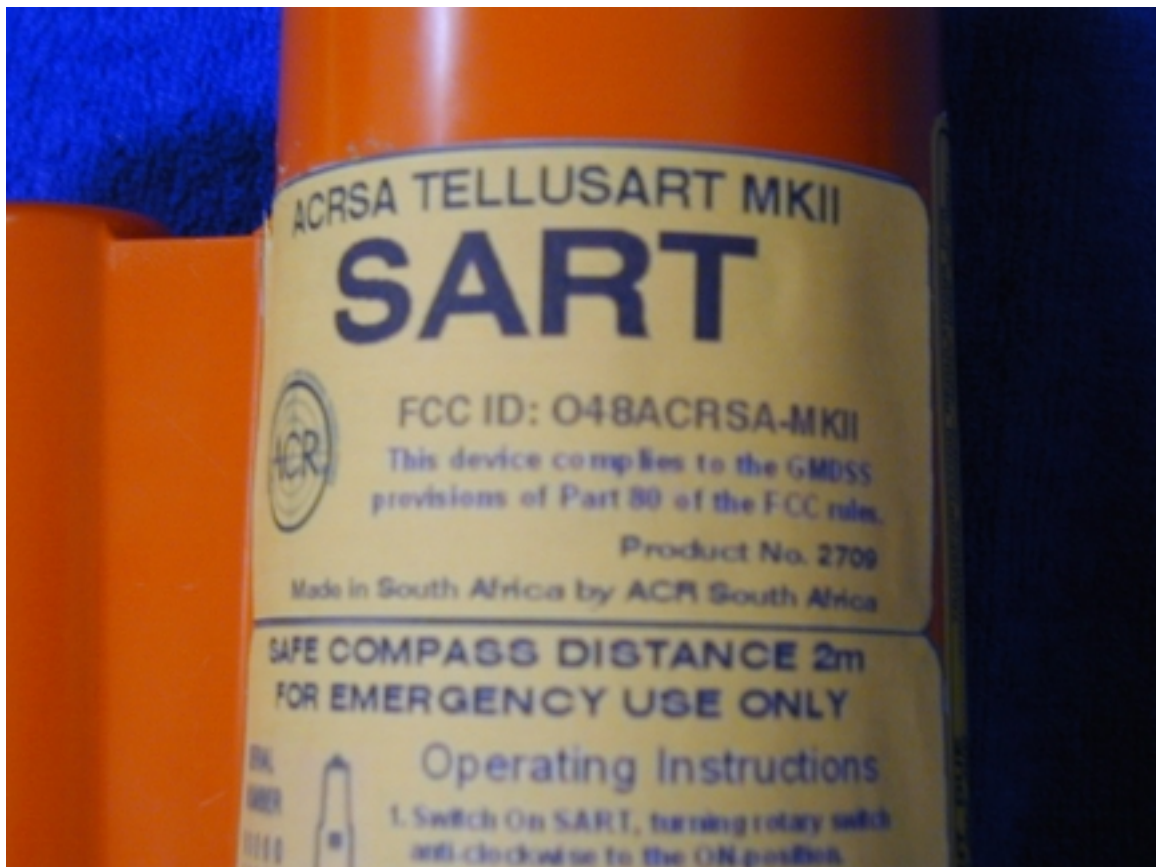
FIGURE 5 PART 80 COMPLIANCE LABEL

THIS DEVICE COMPLIES WITH THE GMDSS PROVISIONS OF PART 80 OF THE FCC RULES.