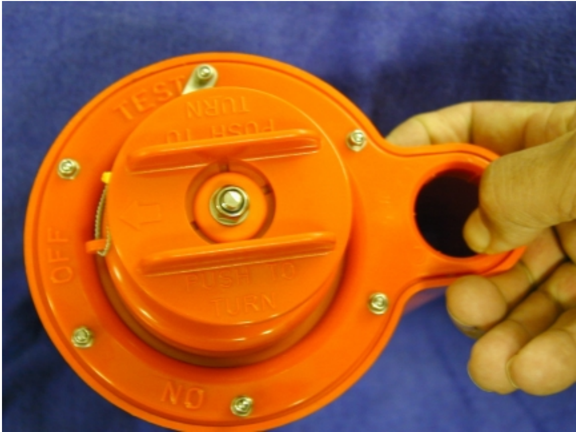
FIGURE 1 SART ACTIVATION SWITCH