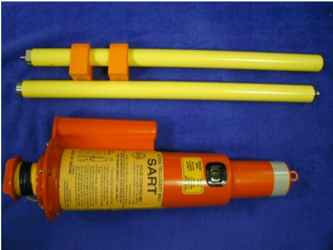
FIGURE 2 SART WITH MOUNTING POLE