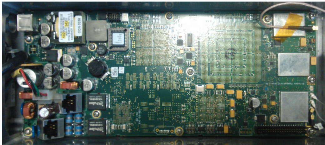
Baseband board (top) with cables removed