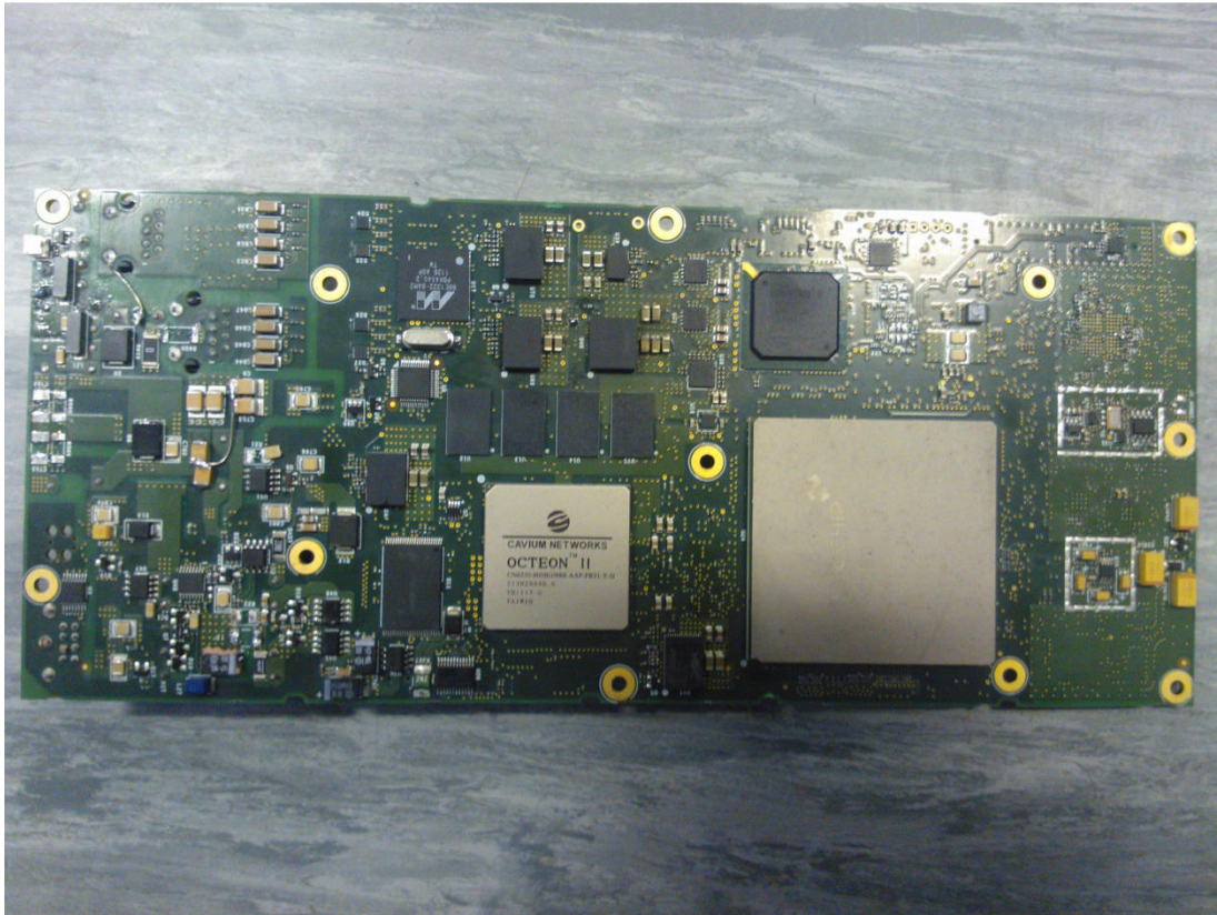
Baseband board (underside)