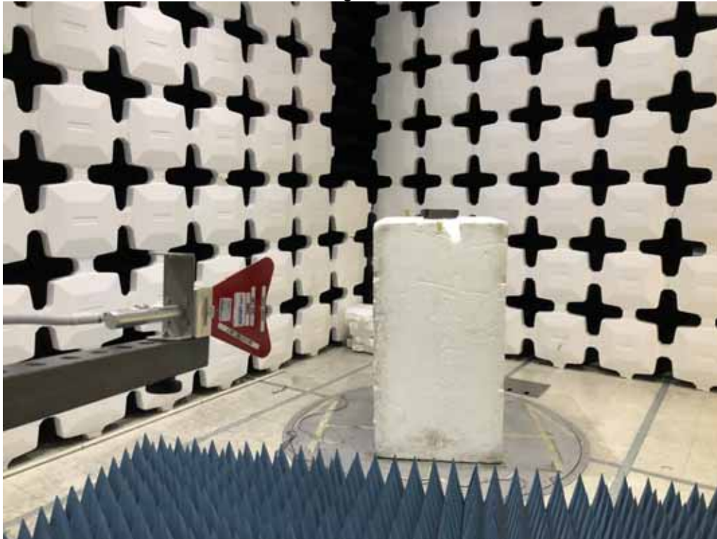
Test Setup for Radiated Emissions, 1GHz to 18GHz – Horizontal Polarization