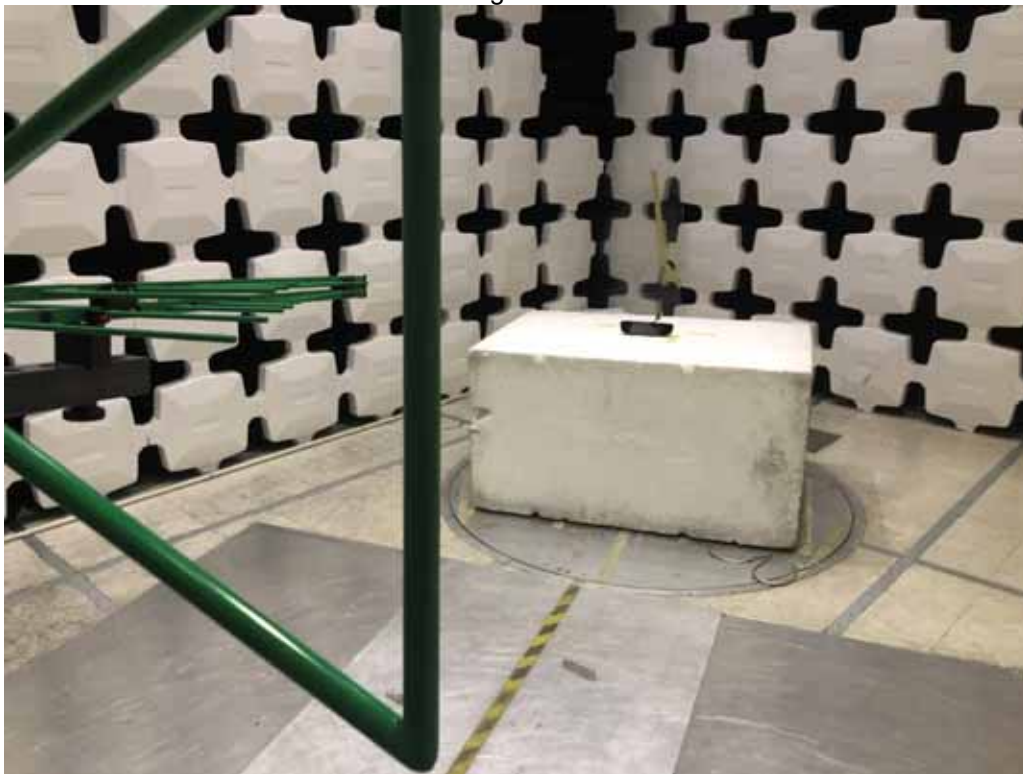
Test Setup for Radiated Emissions, 30MHz to 1GHz – Horizontal Polarization