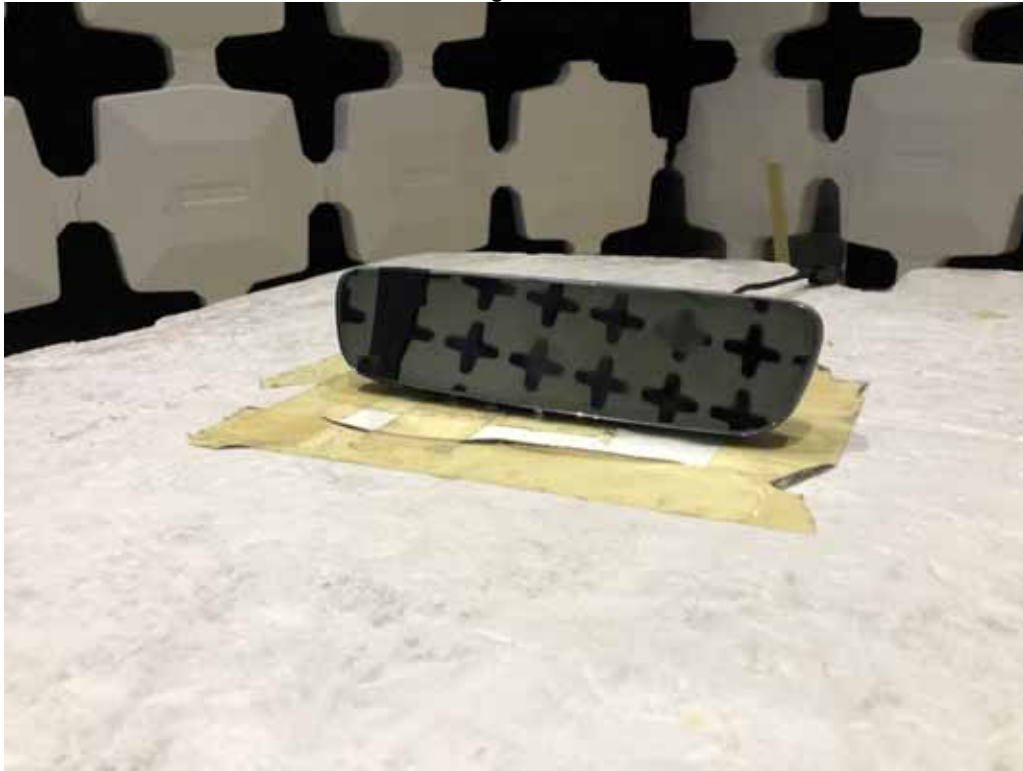
Photograph of the EUT