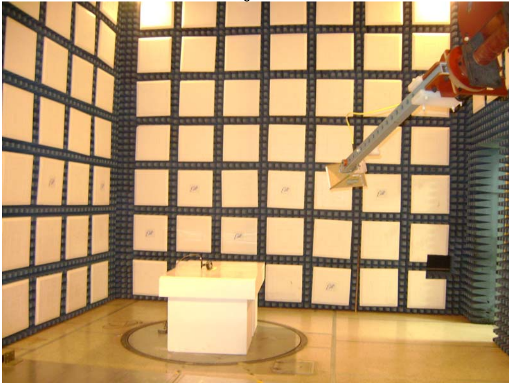
Test Set-up for Radiated Emissions, 1GHz to 5GHz – Vertical Polarization