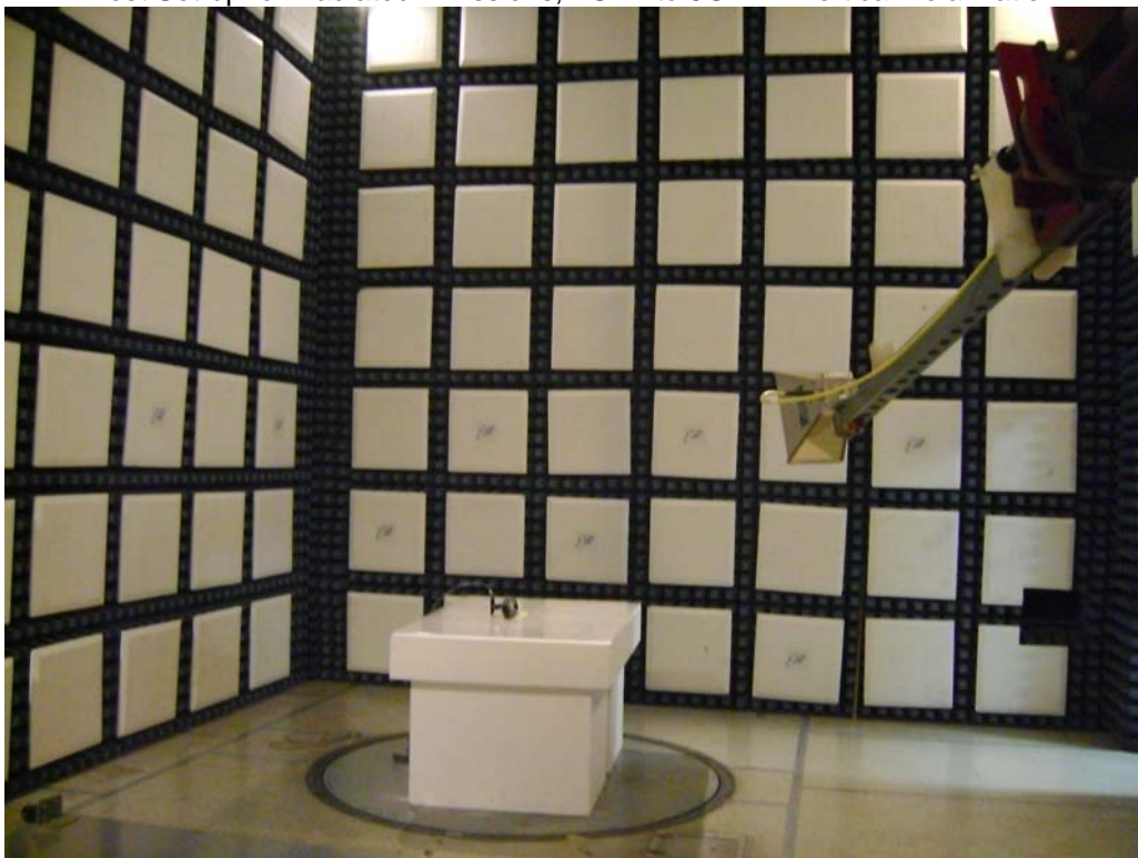
Test Set-up for Radiated Emissions, 1GHz to 5GHz – Horizontal Polarization