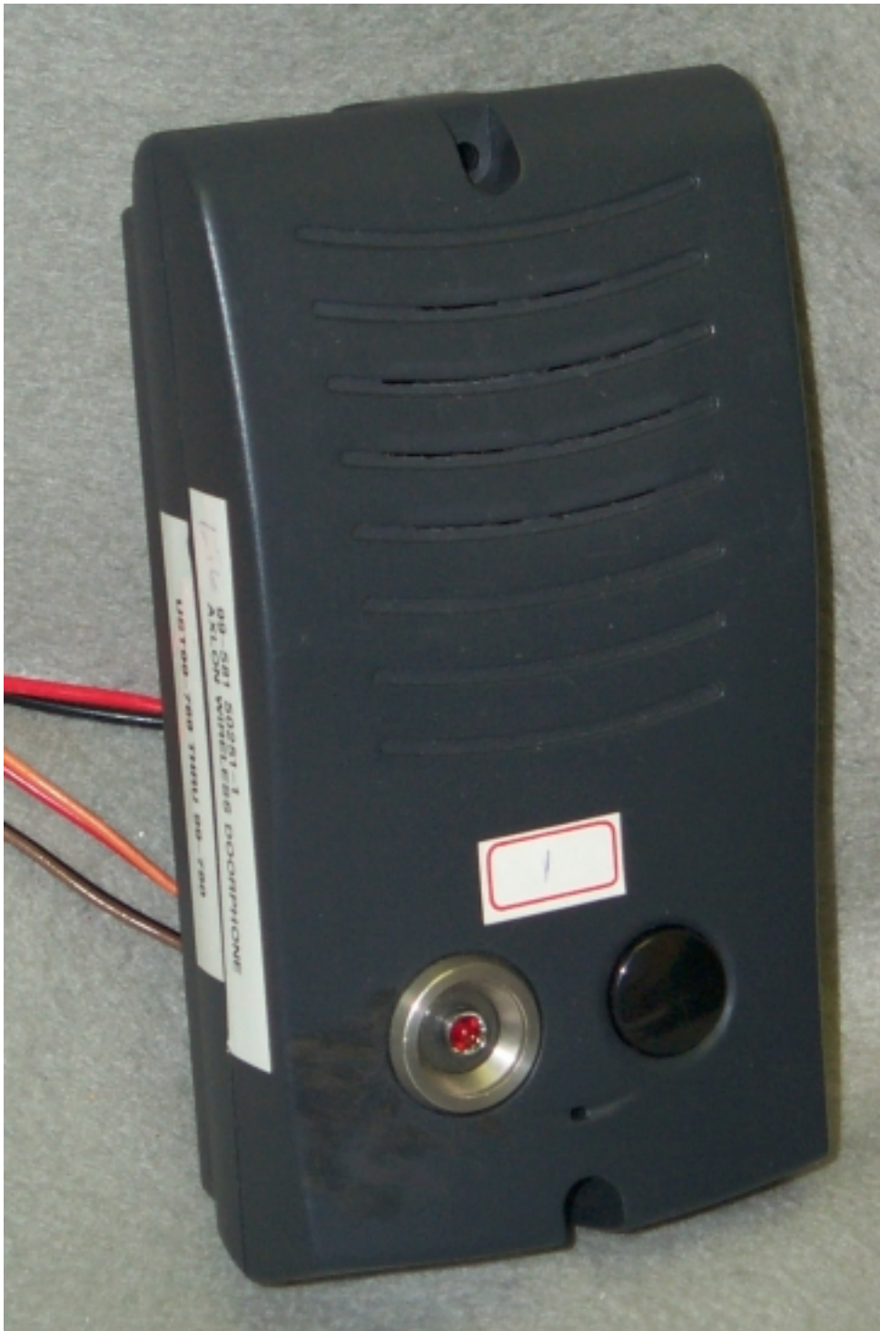
Photo 1. EUT, Front View