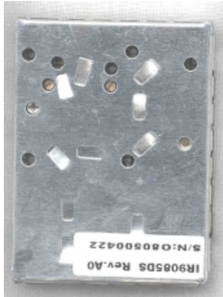
Photo 13. EUT, Bottom View of Transceiver Board with Shield