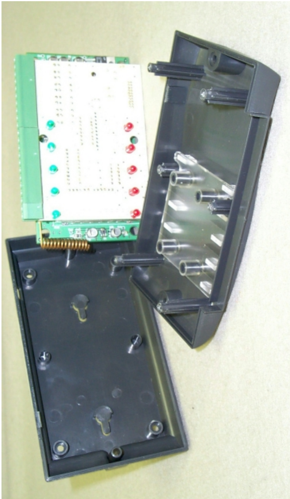
Photo 3. EUT, Top View with Case Opened