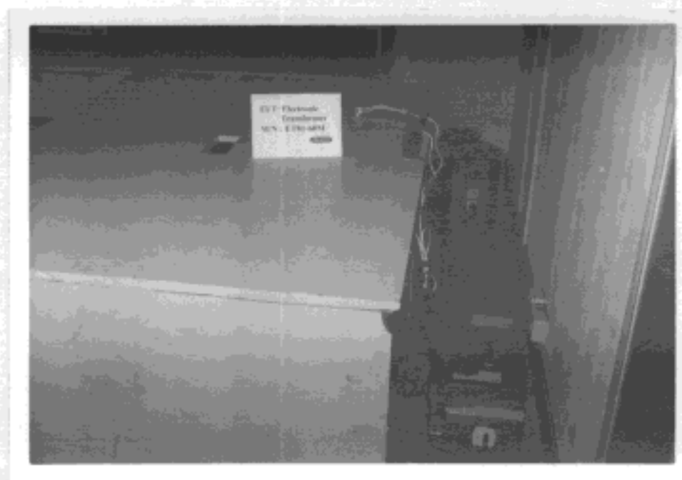
BACK VIEW OF CONDUCTED MEASUREMENT