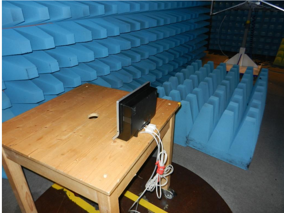
Figure 1: Radiated Emissions below 1 GHz