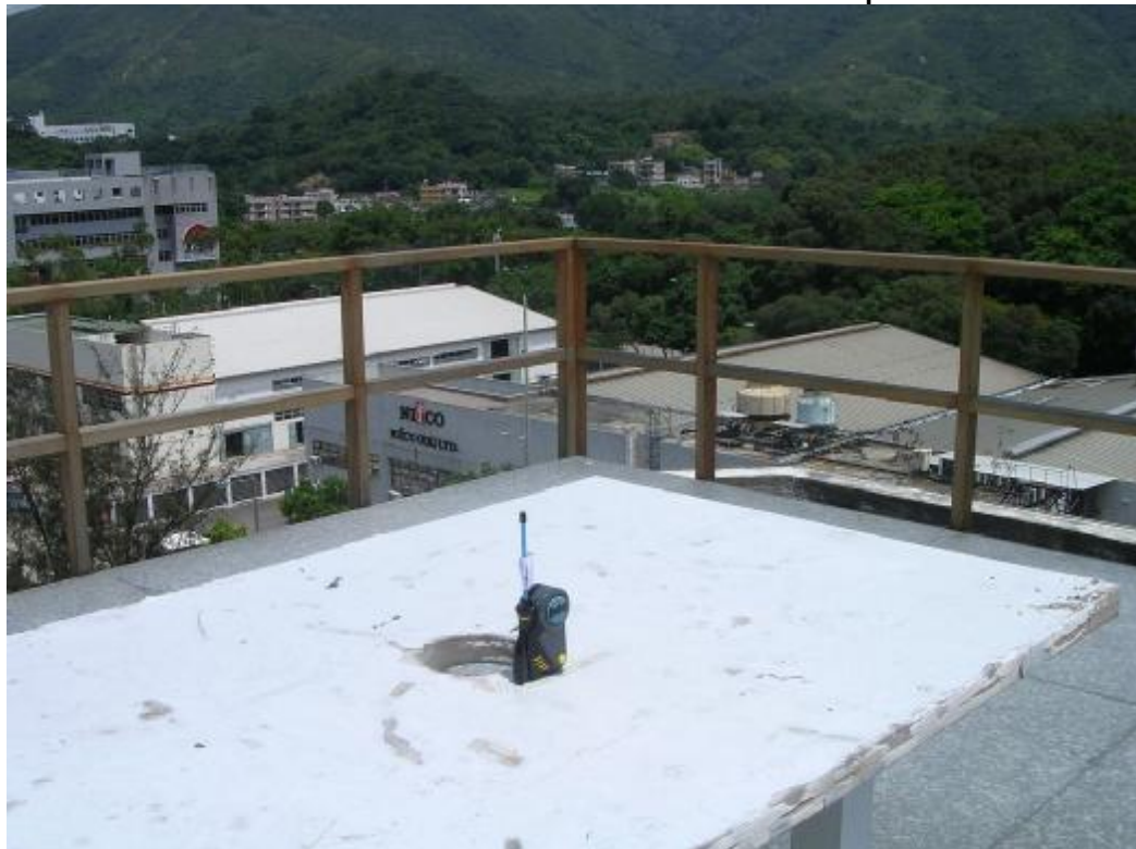
Measurement of Radiated Emission Test Set Up