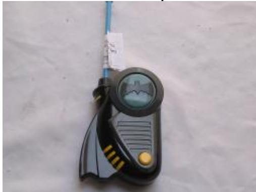
Front View of the product