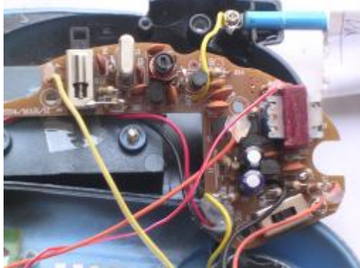
Inner Circuit Top View