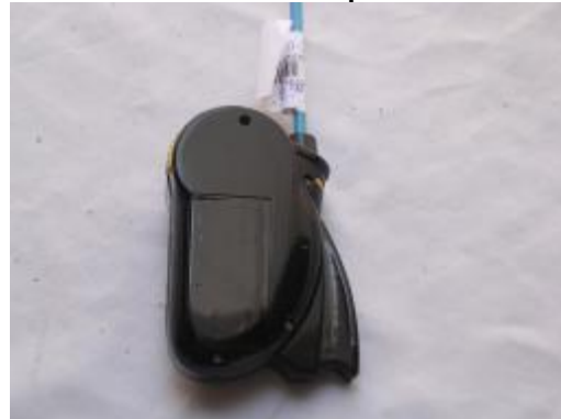
Rear View of the product