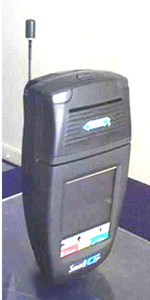
Hypercom Smart Ice MOBITECH