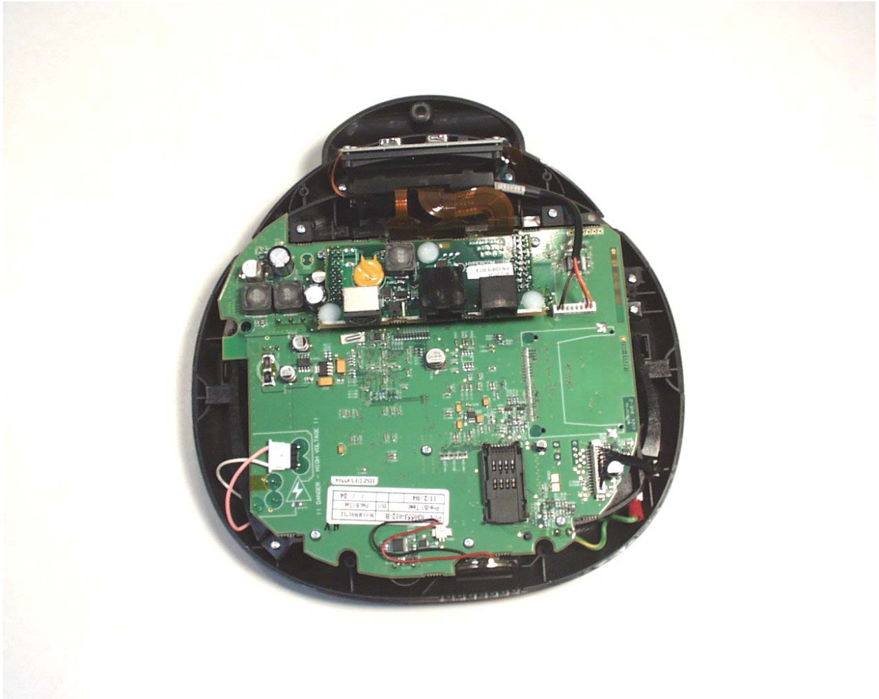
Internal View of the L4100