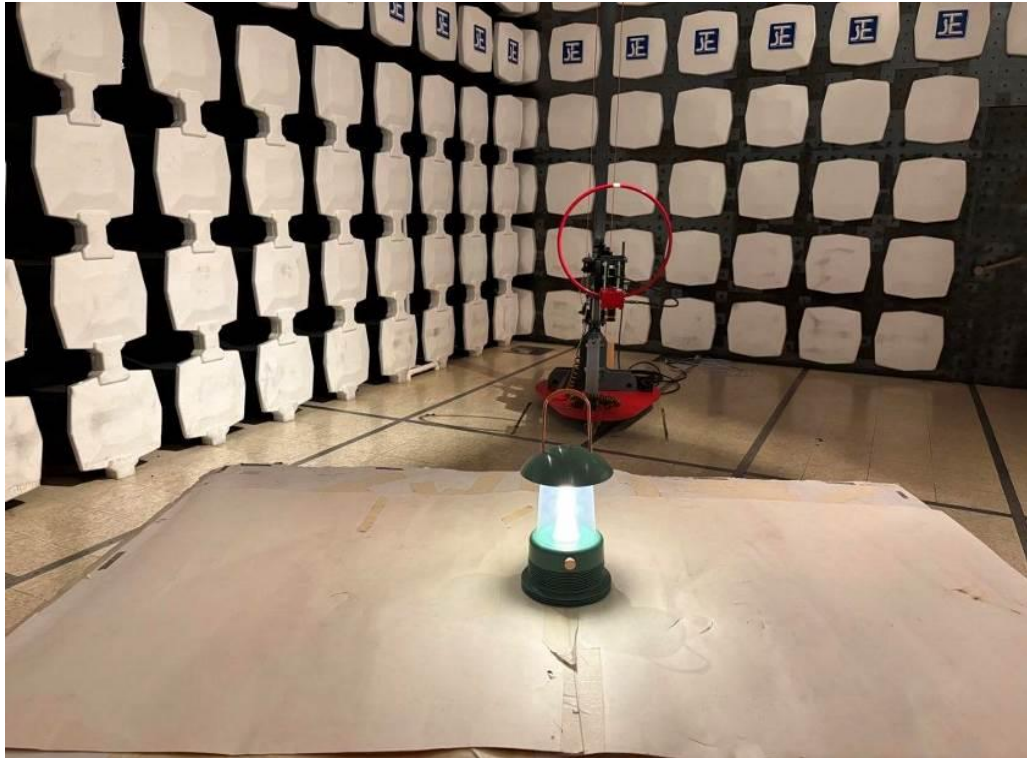
Measurement of Radiated Emission Test Set Up (30MHz to 1000MHz)