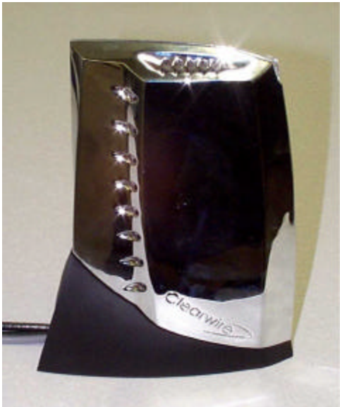
Figure 1-2 IDU