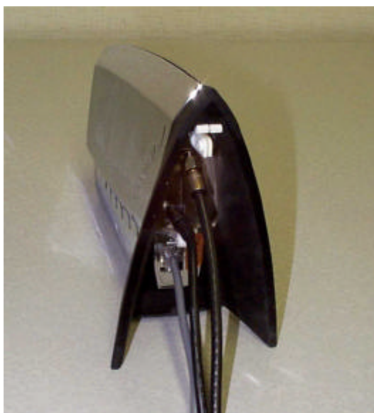
Figure 1-3 IDU Bottom View