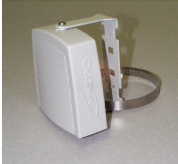
Figure 1-5 ODU (for illustration only, Part of the Antennae