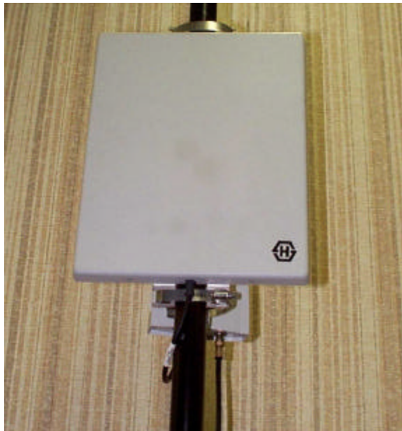
Figure 1-6 ANT_3X3 High Gain Panel Antenna