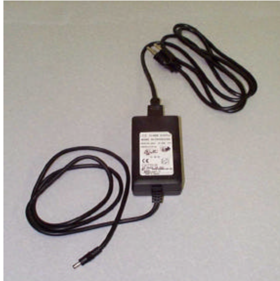
Figure 1-4 Power Supply