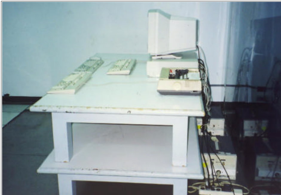
Conducted Emission Setup Photos (Worst Emission Position)