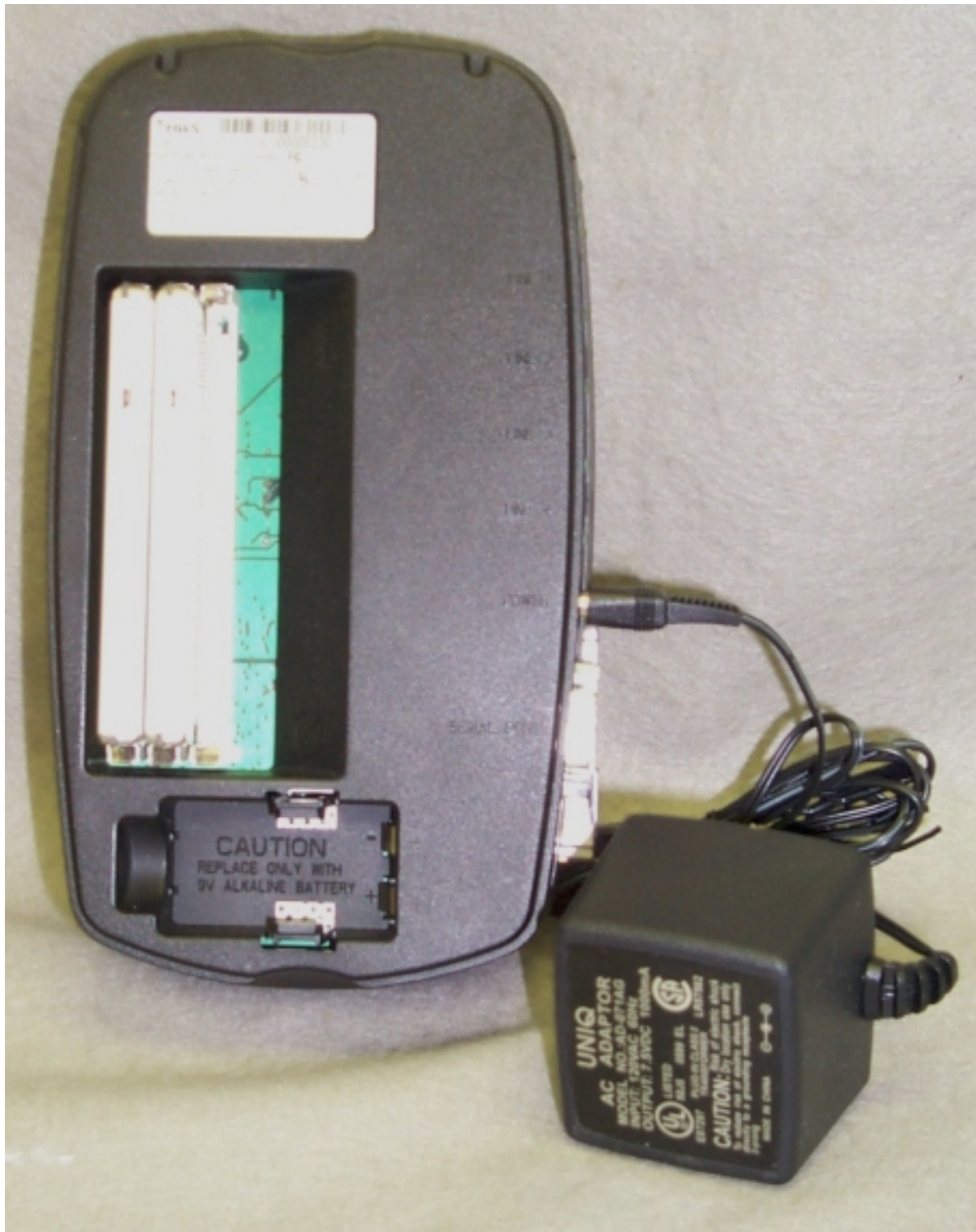
Photo 1. Front View of EUT as Tested with NCU