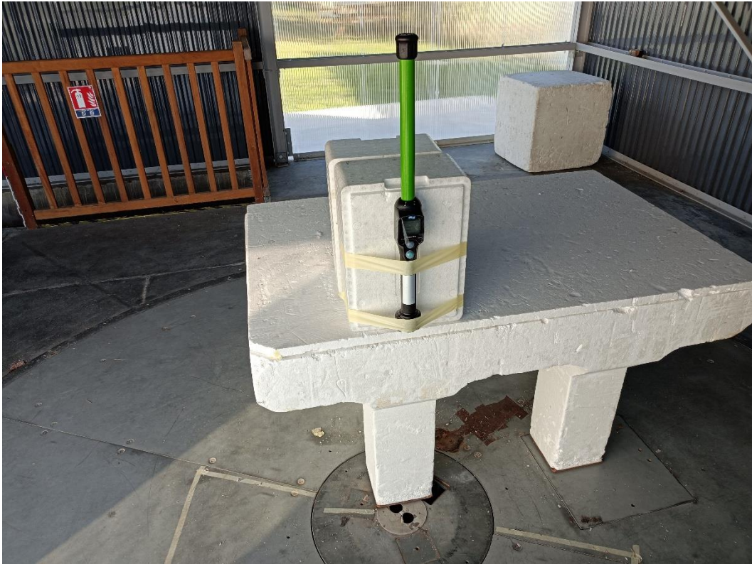
Open Area Test Site in Position 1 with battery