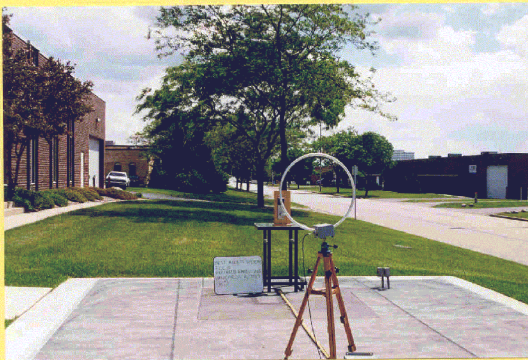
TEST SETUP FOR RADIATED EMISSIONS MEASUREMENTS MAXIMIZED FOR MEASUREMENT OF WORST CASE EMISSIONS VERTICAL POLARIZATION