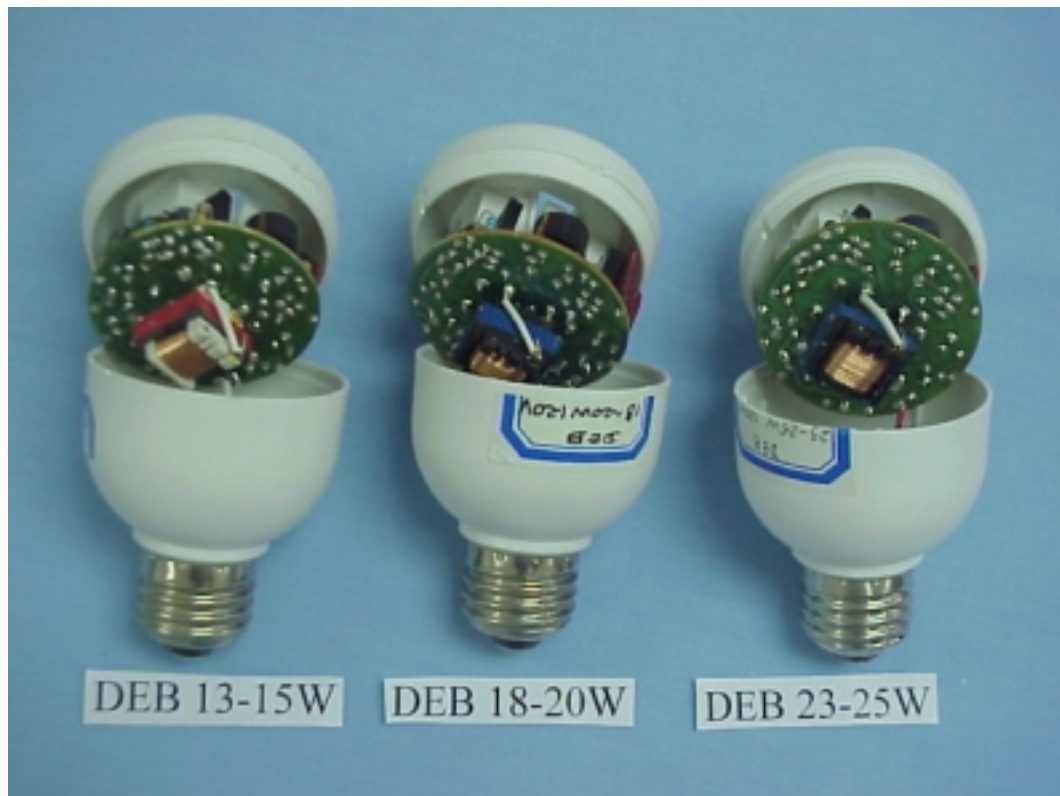
FIGURE 1 ELECTRONIC ENERGY SAVING LAMP (M/N: DEB SERIES) COVER REMOVED