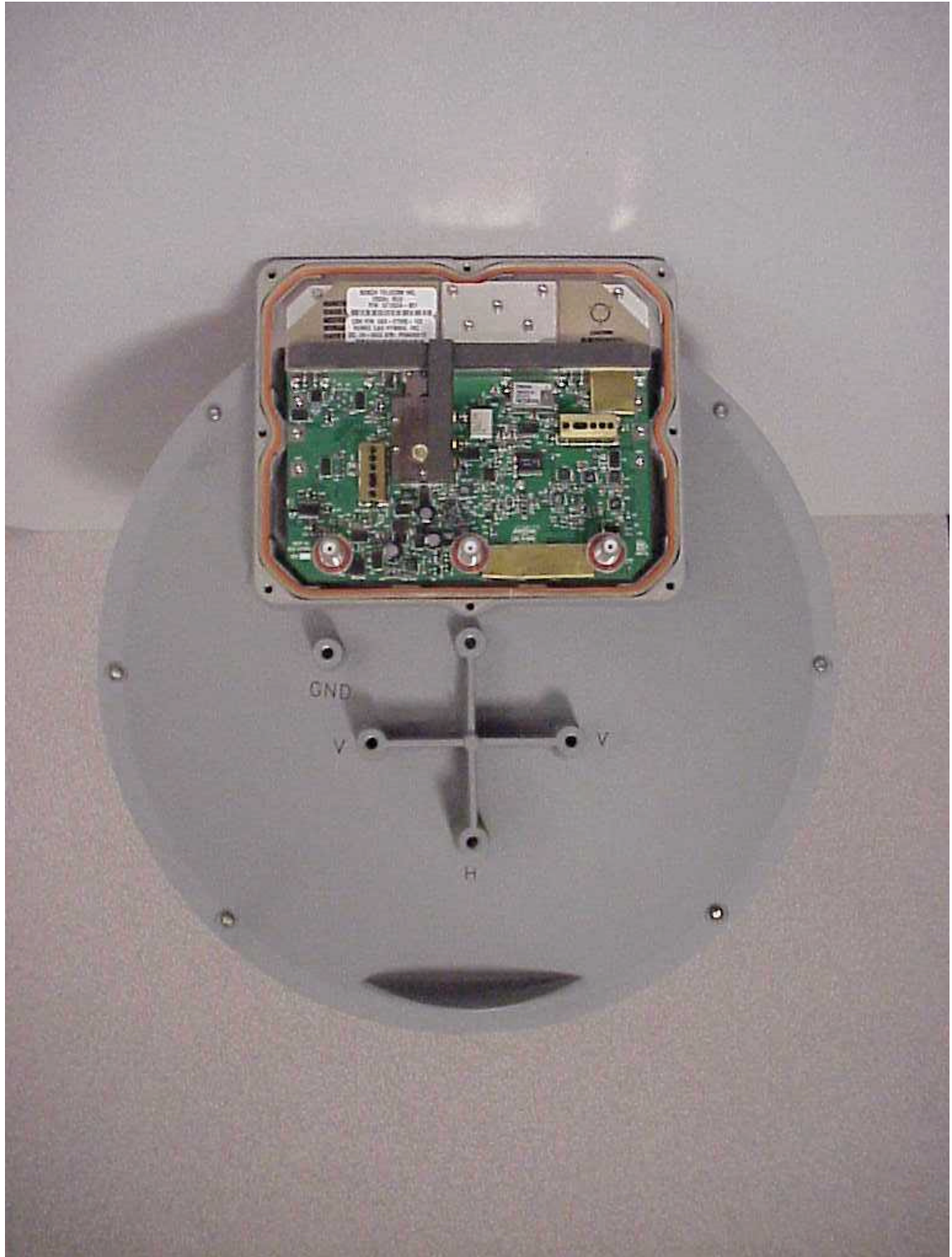
Figure 9-2 CPE Roof Unit with Electronics Board - Cover Removed