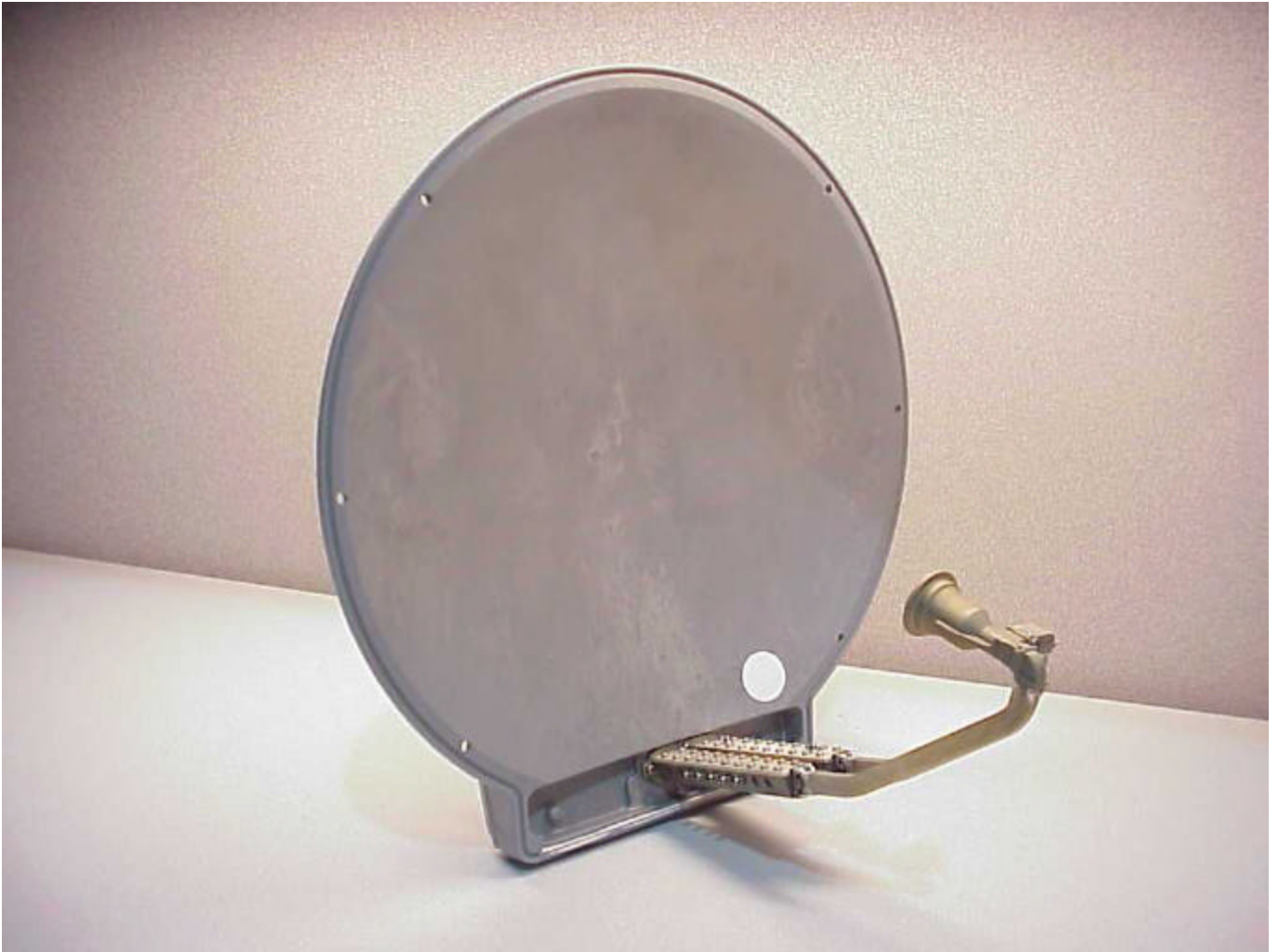
Figure 9-4 CPE Roof Unit With Radome Removed