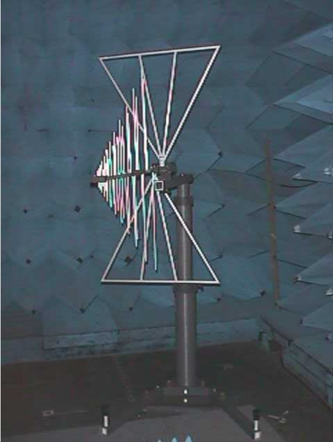
Figure 7-3 Setup for radiated emission measurements (Rx Antenna)