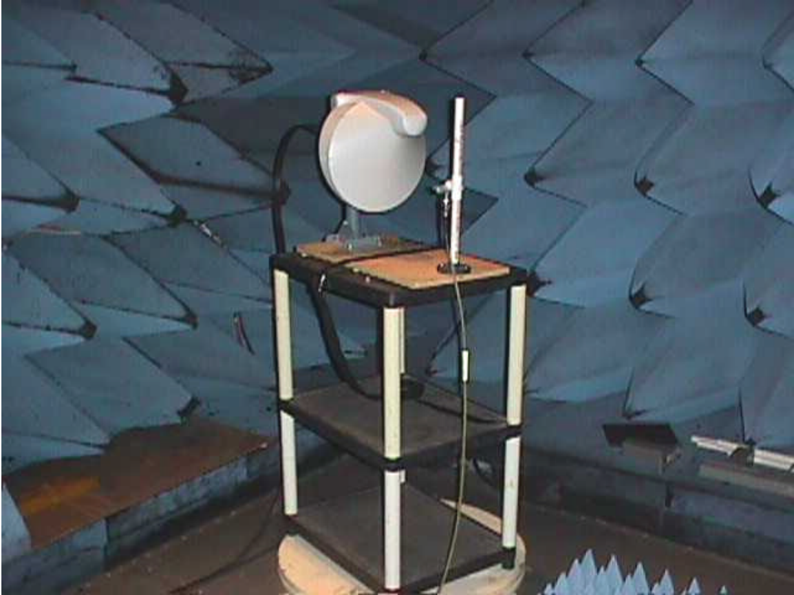
Figure 7-2 Setup for radiated emission measurements (UUT)