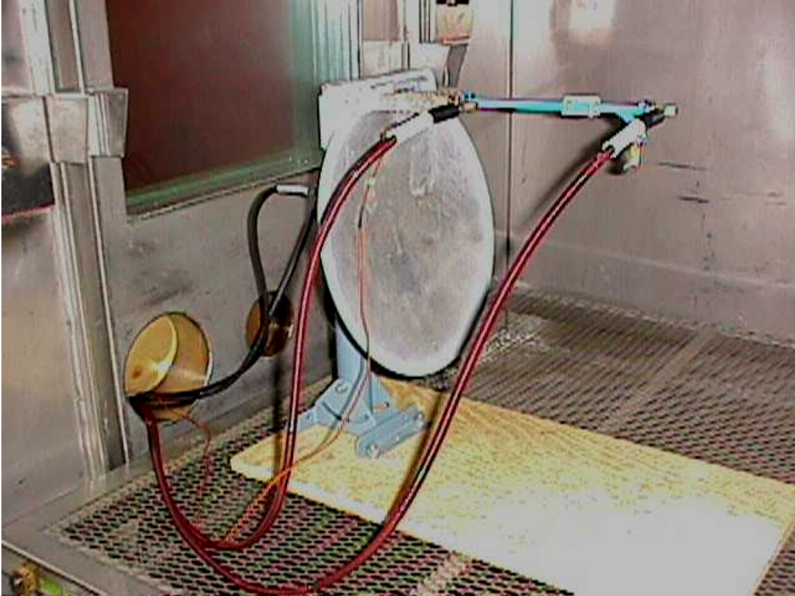
Figure 7-4 Setup for frequency stability measurements - chamber