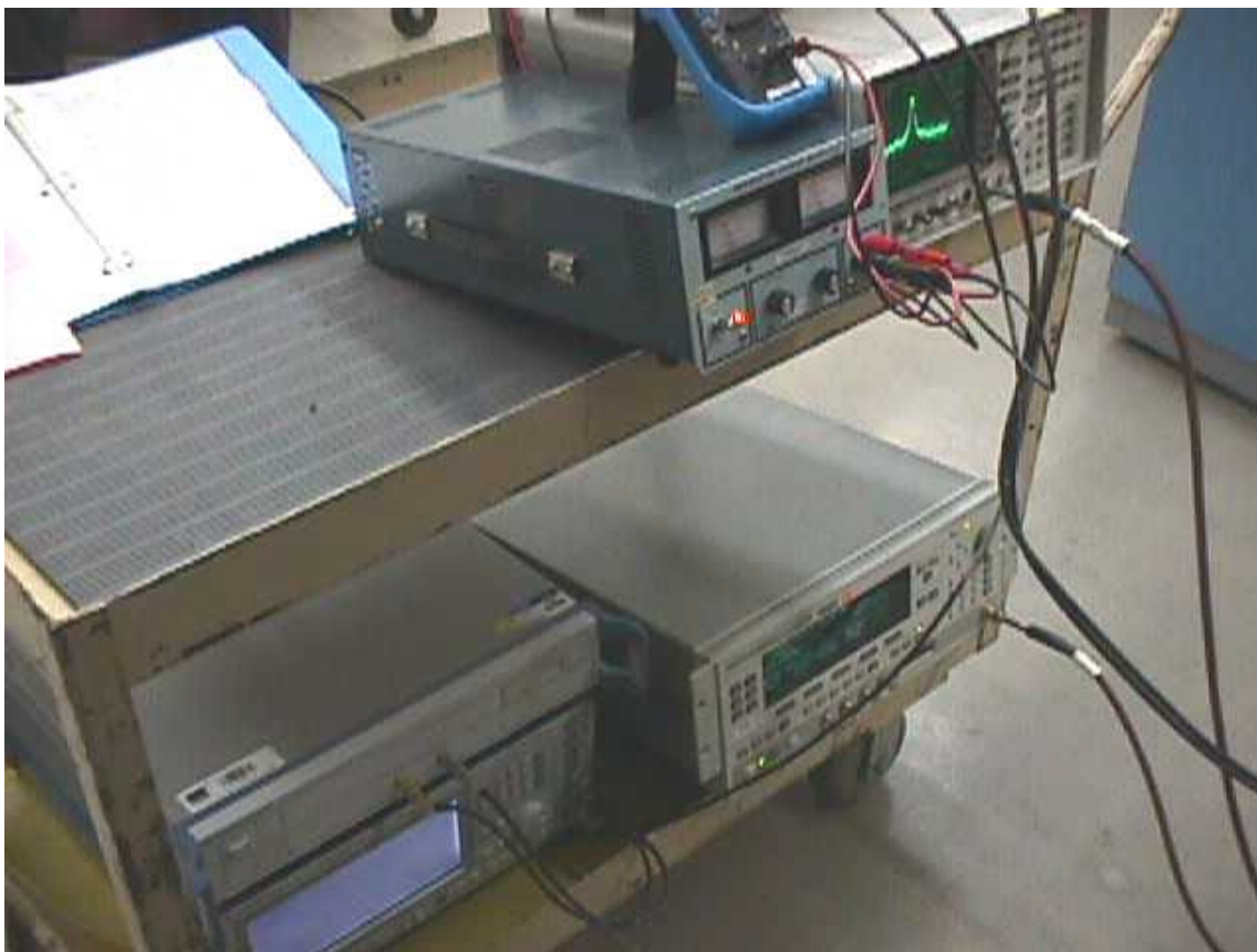
Figure 7-5 Setup for frequency stability measurements - equipment