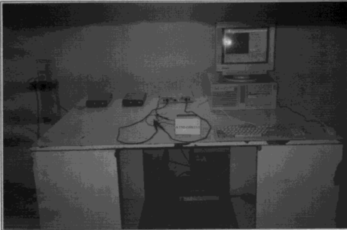
FRONT VIEW OF CONDUCTED TEST