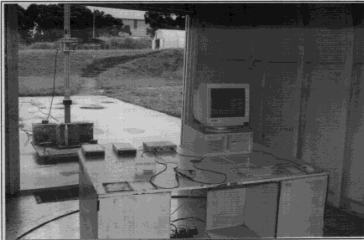
SETUP WITH MAXIMUM DETECTED EMISSION AT HORIZONTAL POLARIZATION