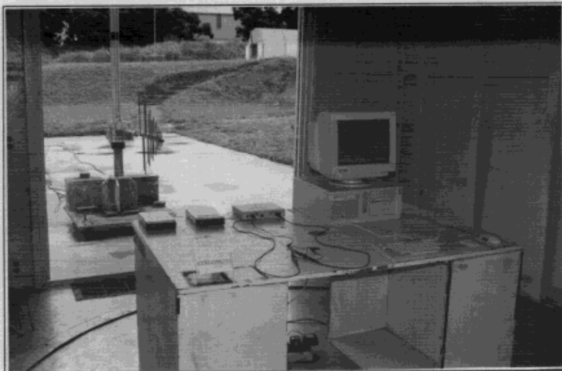
SETUP WITH MAXIMUM DETECTED EMISSION AT VERTICAL POLARIZATION