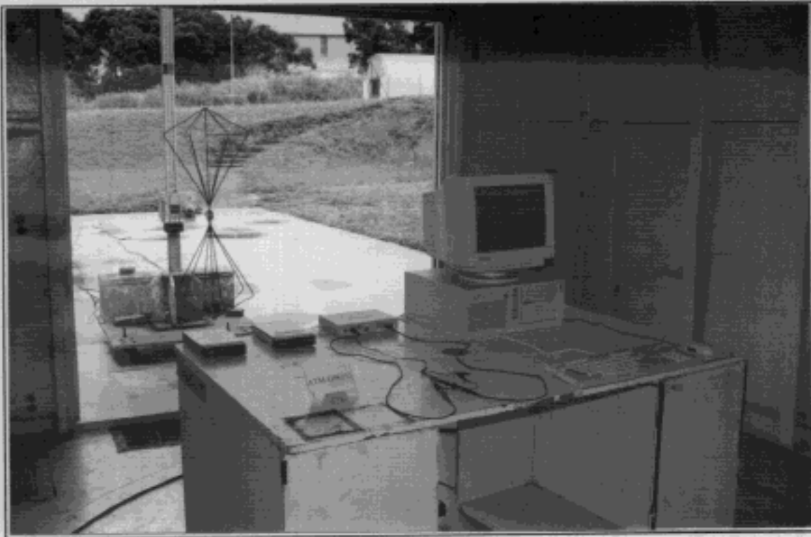
FRONT VIEW OF RADIATED TEST