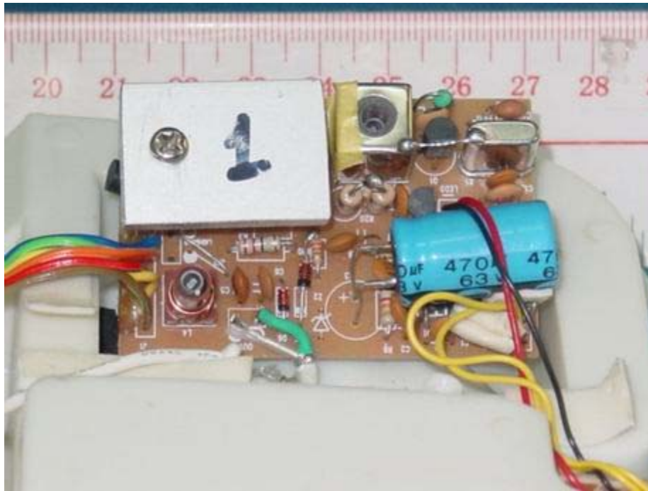
Main PCB and CD jack